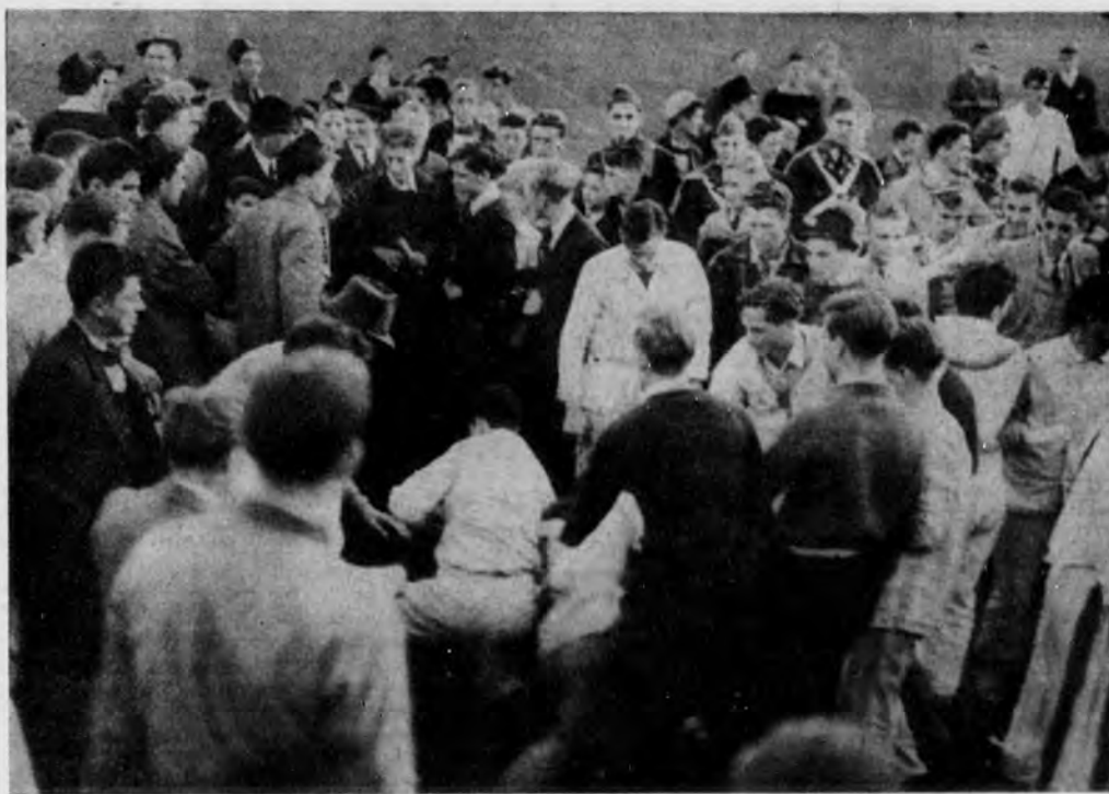
First year men in action between the halves of the Drexel game last Saturday. Their lack of cooperation culminated a month of insubordination, says the Council. Editorial on page two.