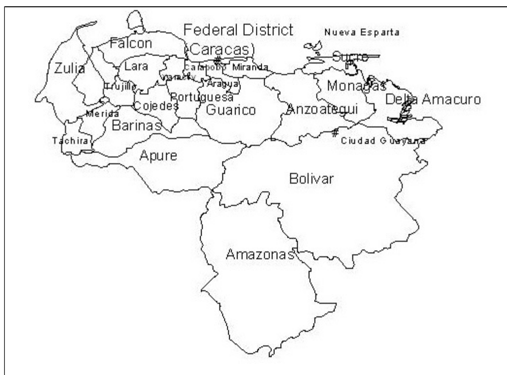
Figure 1 Venezuela by state, 1990

Migrant exchange ratios between Bolívar State and the other 22 states are also examined for the five census years. These ratios compare the number of life-time immigrants to outmigrants between Bolívar State and each of the other Venezuelan states. A figure of 1.0 represents an equal exchange of life-time migrants between Bolívar State and another state. Figures below 1.0 represent a loss of net migrants from Bolívar State, while figures above 1.0 represent a net gain for Bolívar State.