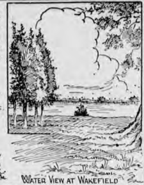
WATER VIEW AT WAKEFIELD