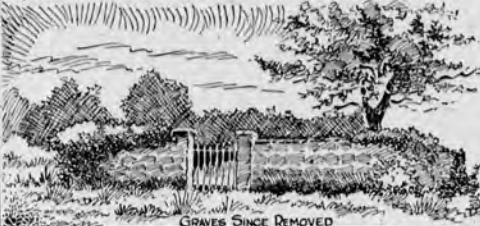
GRAVES SINCE REMOVED

Within a stone-walled enclosure elsewhere on the farm, his forbears slept--his great-grandfather, grandfather and others of close kin. One day, when but a lad near twelve, he came to this place with his Spartan mother and her household to stand by with bared head as the remains of his father were laid away. Sobering scene for a boy upon whom man's responsibilities were soon to fall.