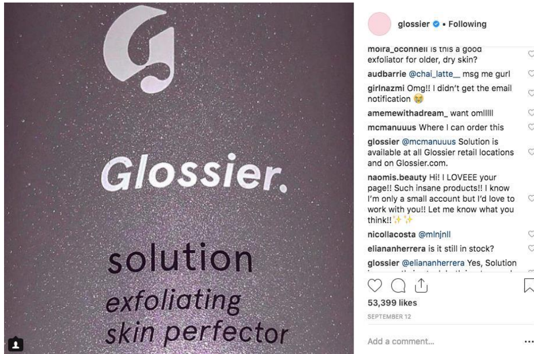
Figure 3.1 Example of Glossier’s Instagram page (screenshot taken October 14, 2018)

In-depth, semi-structured interviews were conducted on active Glossier consumers born between 1990 and 1999 (approximately between the ages of 19 and 28 years). For the purpose of this study, active consumers are defined as individuals who own at least one Glossier product and browse or post on Glossier’s website and social media channels on average once a week. Active Glossier consumers who participated in Glossier’s social media community for at least six months fulfilled the criteria required to participate in the study. Active Glossier consumers were able to discuss the distinctive elements of their motivations for using the brand’s products and