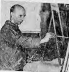
Rockwell Kent, world traveler and painter, artist of the 1939 Christmas Seal of the National Grange Association and its affiliated groups, seals will be on sale throughout the country between Thanksgiving and Christmas.