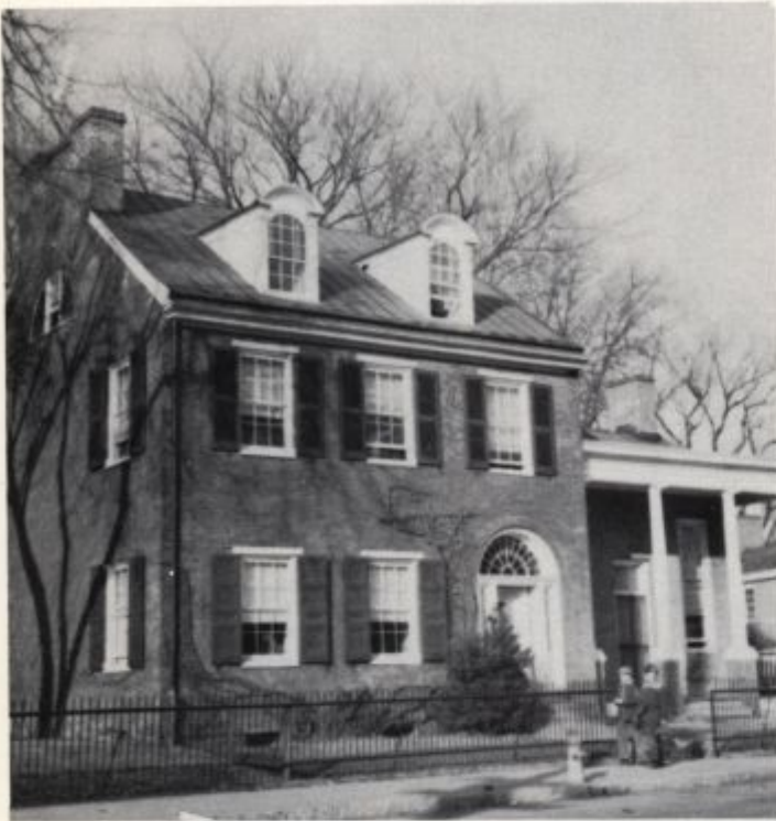
The Alumni Office — PURNELL HALL