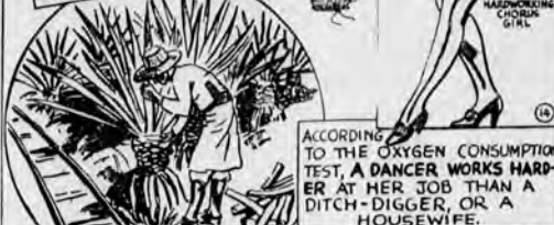
ACCORDING TO THE OXYGEN CONSUMPTION TEST, A DANCER WORKS HARDER AT HER JOB THAN A DITCH-DIGGER, OR A HOUSEWIFE.