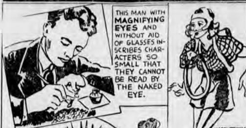
THIS MAN WITH MAGNIFYING EYES AND WITHOUT AID OF GLASSES INSCRIBES CHARACTERS SO SMALL THAT THEY CANNOT BE READ BY THE NAKED EYE.