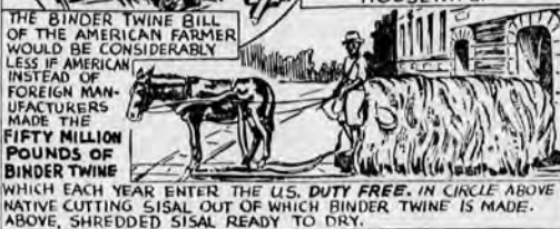
THE BINDER TWINE BILL OF THE AMERICAN FARMER WOULD BE CONSIDERABLY LESS IF AMERICAN INSTEAD OF FOREIGN MANUFACTURERS MADE THE FIFTY MILLION POUNDS OF BINDER TWINE WHICH EACH YEAR ENTER THE U.S. DUTY FREE. IN CIRCLE ABOVE NATIVE CUTTING SISAL OUT OF WHICH BINDER TWINE IS MADE. ABOVE, SHREDDED SISAL READY TO DRY.