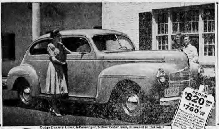
Dodge Luxury Liner, 6-Passenger, 2-Door Sedan $820, delivered in Detroit.