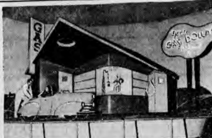
This model gasoline station is one of the many new and interesting features that have been added to the Petroleum Industry Exhibition at the N. Y. World's Fair, 1940. Other new features of the exhibit include a new type airplane, a model farmhouse, an actual oil derrick in operation, a model oil refinery, and an all-technicolor puppet motion picture.