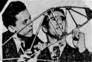
Young Men Prepare for Aviation —Youths 18 and 19 years old will take Civil Aeronautics Authority training at the University of California and a local trade school.