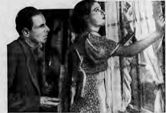
"He's gone, ain't he?" Bragg persisted. "He's gone, I tell you!" (Posed by Arthur Hohl and Loretta Young)

"How do you know?" Flossie persisted. "I got a hunch," said Bragg slowly. The girl gazed with cynicism