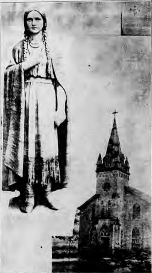
MARY JEMISON, THE WHITE SQUAW, AND ST. IGNATIUS CHURCH

On a commanding elevation, on a by-road about half a mile from the main road, sits St. Ignatius Church, the first unit of which was erected in 1817 and the tower and spire in 1895.