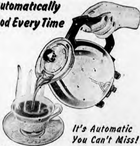
It's Automatic You Can't Miss!