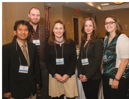
SPPA students support the scholarship fundraiser.

On a personal note, as some of you know, I lost my father to cancer over the holidays. He was diagnosed at the beginning of August, and passed away in mid-December. My father was a simple man who did not always understand the world around him. For example, he never understood exactly what it is I am studying in college. For the longest time he thought I was studying to be an accountant. When he finally realized that finance was something different, he wanted to know why I wasn't studying to be an accountant because they get paid more. In all seriousness, one of the few things my father did understand was value. When I withdrew from classes in November to help with his care, my father wept. He was afraid that I would not return to finish my studies and all my hard work would be for nothing and that the value of my degree would be lost. Truthfully, so was I.