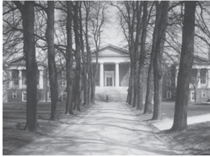
Old College Hall as photographed on April 17, 1936 and April 4, 2013.

shooting the rephotographs with a large-format camera, similar to the one