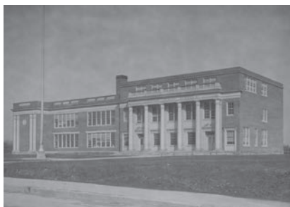
Pearson Hall as photographed on March 12, 1926 (called Newark School Building at the time) and April 4, 2013.