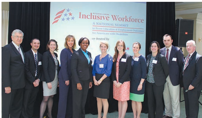
UDA and IPA representatives proudly planned and supported "Building a More Inclusive Workforce: A National Summit to Boost Education and Employment Outcomes for Americans with Disabilities."

Sessions focused on framing a national agenda for disability employment, including integrating veterans and youth in the workforce and building public-private partnerships. As current chair of the National Governors Association (NGA), Governor Markell and his staff discussed themes from NGA's disabilities initiative, "A Better Bottom Line: Employing People with Disabilities." Ideas generated from the event will be part of a continuing discussion on national policies around education and employment opportunities for Americans with disabilities.