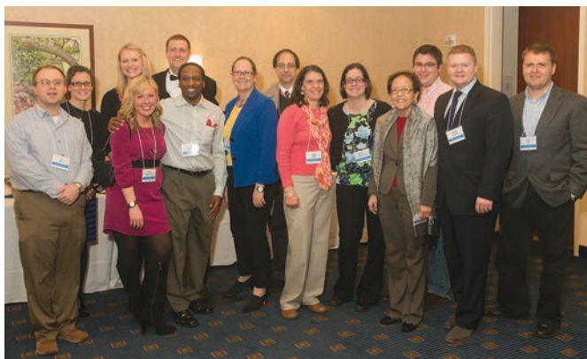
SPPA alumni in attendance at the fundraiser event.

The next fundraiser is being planned for 2015, and the school looks forward to providing even more opportunities for future generations of public service leaders.