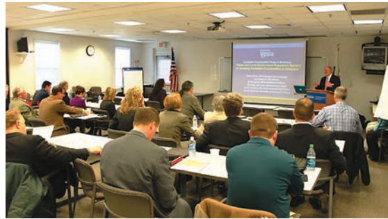
IPA hosted a series of Spring 2013 workshops to address "State and Local Government

encourage economic development, sound transportation and housing choices, a healthy environment and strong communities, and is gaining momentum at the state and local government levels. The Institute for Public Administration (IPA) has been working to develop a framework to plan for Complete