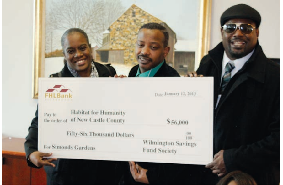
Blueprint Communities, supported by CCRS, aided Neighbors Helping Hands and Habitat for Humanity in pursuing a grant to assist elders and individuals with disabilities in need of home repairs.

The seven communities currently in the program have raised over $700,000 in the past year, and these grant funds will help their initiatives move forward. The impact is increased by a commitment from another CCRS