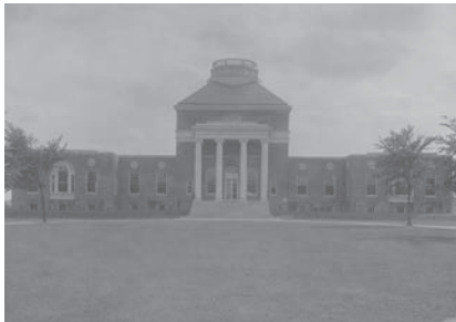
Memorial Hall as photographed October 6, 1925 (called Memorial Library at the time) and April 4, 2013.

Hammond frequently rephotographed images himself for reasons unknown. His collection of more than 2,000 glass plate negatives is now housed in the Delaware Public Archives, and about two dozen of them depict various University buildings from the 1920s and '30s.