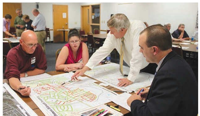
Town of Elsmere, DE stakeholders provide input on community-specific planning issues at a Complete Communities workshop.