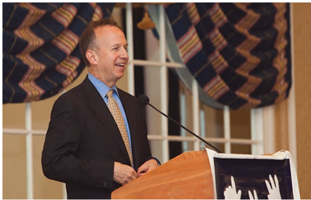
Delaware Governor Jack Markell gives remarks during the release event for the 2013 Kids Count in Delaware fact book.

KIDS COUNT in Delaware is led by a board of dedicated family and children advocates from both the public and private sectors, and is one of fifty-three similar projects throughout the United States and the U.S. territories funded by the Annie E. Casey Foundation. Copies of the 2013 Fact Book are available on the website: www.dekidscount.org .