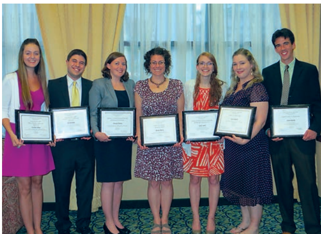
SPPA honors awards recipients pose proudly with their plaques.