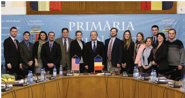
SPPA's Winter 2013 study abroad students meet with the mayor of Cluj-Napoca, Romania (center) as well as several Romanian public administration students and professors.