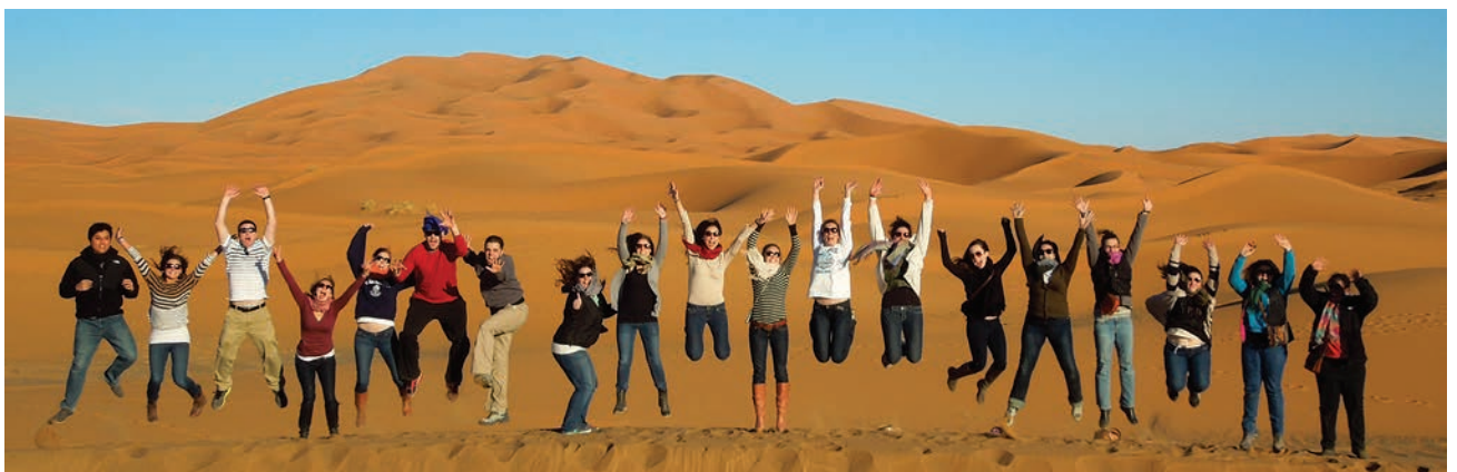
The students celebrate their visit to the Sahara desert.