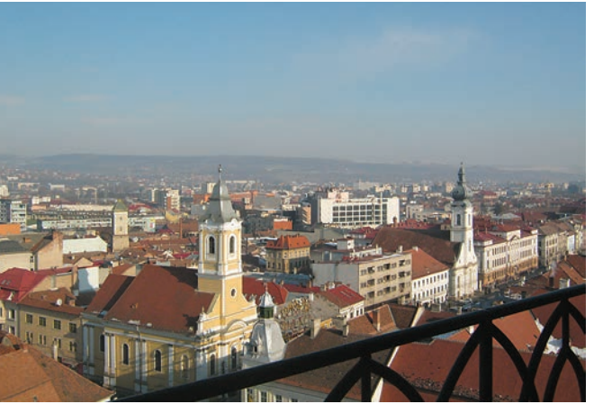
A birds-eye view of the city of Cluj-Napoca in Romania.

Both the SPPA and BBU research teams met with elected officials, government employees, private-sector leaders and nongovernmental organization (NGO) organizers to conduct research on topics of interest.