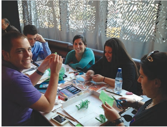
Students work diligently on one of their design challenges — to design an urban garden in the middle of Barcelona's historic Las Ramblas Boulevard.

The group first traveled to Stockholm, Malmo, and Gothenburg in Sweden where the month-long study abroad began with an informative