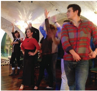
A group of students get a lesson in flamenco dancing.

Emulating real-world leadership and design, the program was highly experiential and challenge-based. It was comprised of small-group and individual activities designed to elicit specific ideas and create a culture of inquiry and individualized pursuit of learning. Students were required to tackle major design challenges in small teams with projects including the design of an amusement park ride, a garden near