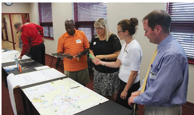
A Complete Communities workshop engaged City of Milford stakeholders in facilitated mapping exercises.

Complete Communities is a new integrated planning approach that supports astute land-use decisions and encourage economic development, sound transportation and housing choices, a healthy environment and strong communities, and is gaining momentum at the state and local government levels.