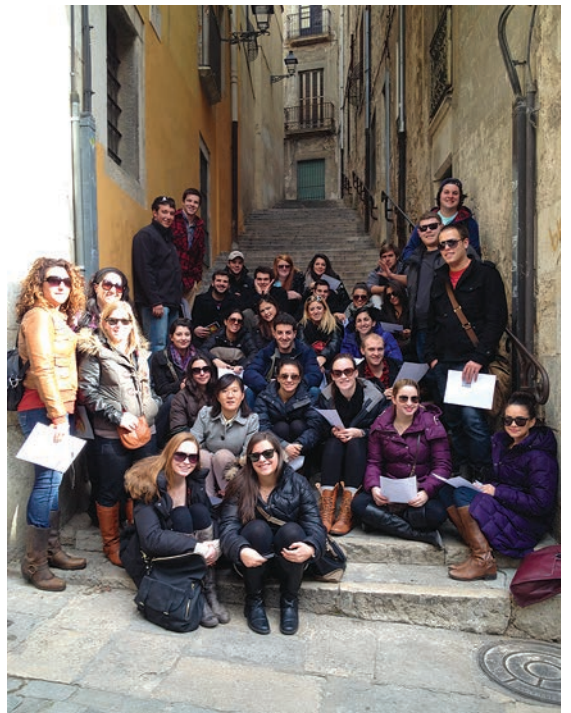
The medieval coastal city of Girona, Spain is the setting for a unique learning experience.

the Modern Art Museum, took a tour of the Royal Dramatic Theater, spent a day exploring Copenhagen, surveyed