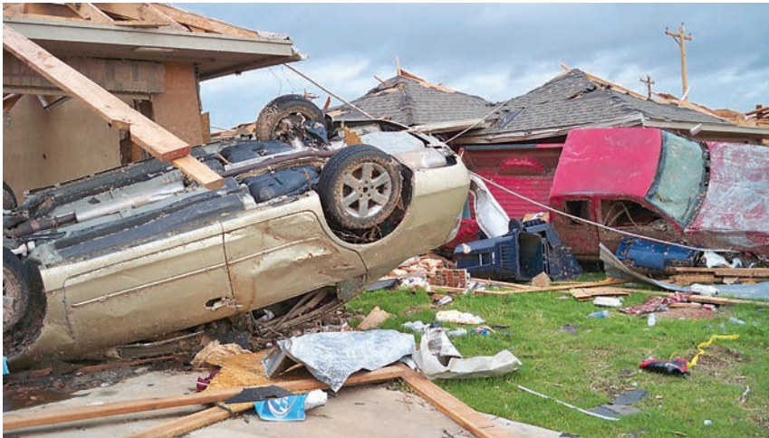
The Oklahoma tornado destroyed a huge number of homes and families' property.

The valuable data gathered by the DRC research teams during their time in Oklahoma will contribute to their research projects in significant ways. Each team studied varied aspects of dealing with an event that results in loss on many levels, both human and material. A common thread among them is the research aims to improve efforts in managing the devastating consequences that individuals and communities experience in the aftermath of a disaster.