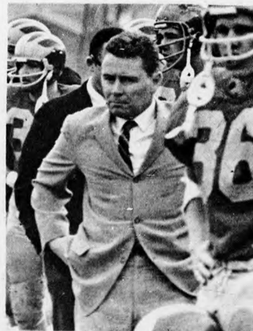
I'm Going To Kill That Kid.