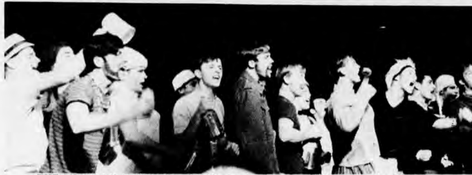
THE MEN AND WOMEN(?) of ATO sing loud and clear of times at the Creek during their winning playbill last Thursday night.