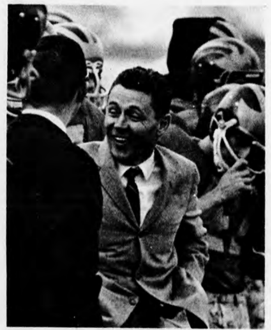
Lehigh 21, Lafayette 6.