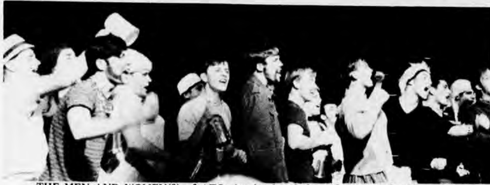
THE MEN AND WOMEN(?) of ATO sing loud and clear of times at the Creek during their winning playbill last Thursday night.