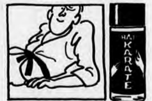
Our Hai Karate Lounging Jacket is practically rip-proof.

We keep warning you to be careful how you use Hai Karate® After Shave and Cologne. We even put instructions on self-defense in every package. But your best silk ties and shirts can still get torn to pieces. That's why you'll want to wear our nearly indestructible Hai Karate Lounging Jacket when you wear Hai Karate Regular or Oriental Lime. Just tell us your size (s,m,l) and send one empty Hai Karate carton, with $4 (check or money order), for each Hai Karate Lounging Jacket to: Hai Karate, P.O. Box 41A, Mount Vernon, N.Y. 10056. That way, if someone gives you some Hai Karate, you can be a little less careful how you use it.