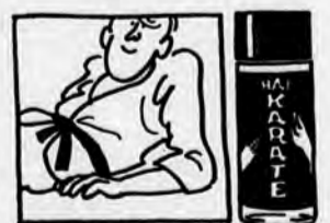
Our Hai Karate Lounging Jacket is practically rip-proof.

We keep warning you to be careful how you use Hai Karate® After Shave and Cologne. We even put instructions on self-defense in every package. But your best silk ties and shirts can still get torn to pieces. That's why you'll want to wear our nearly indestructible Hai Karate Lounging Jacket when you wear Hai Karate Regular or Oriental Lime. Just tell us your size (s,m,l) and send one empty Hai Karate carton, with $4 (check or money order), for each Hai Karate Lounging Jacket to: Hai Karate, P.O. Box 41A, Mount Vernon, N.Y. 10056. That way, if someone gives you some Hai Karate, you can be a little less careful how you use it.