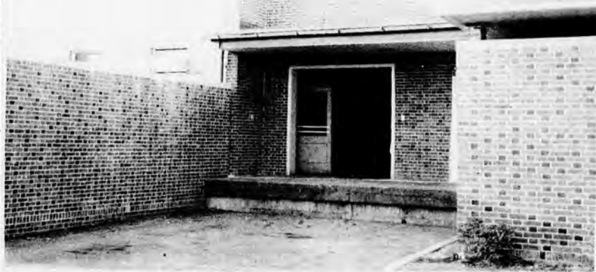
Reception Entrance of Student Center, where seniors and guests will make merry during the 1962 Senior Weekend. Garbage pickup will be rescheduled so as not to coincide with the festivities.

Senior Weekend, final social fling for the graduating class in June, will take place in the Student Center this year.