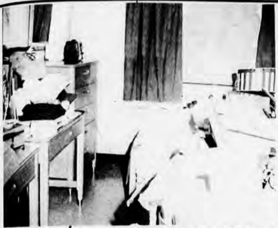
A Delaware dormitory room AFTER rare cleaning by award-seeking maid.