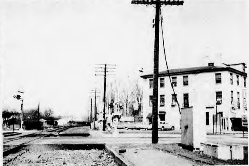
Proposed site of new Blue Hen football stadium. The purpose of this move is to utilize the present stadium site for an agricultural experiment while situating the stadium in a more stimulating environment

office, he concluded that "(Hic) The move will also make for a more relaxed student and faculty relationship."