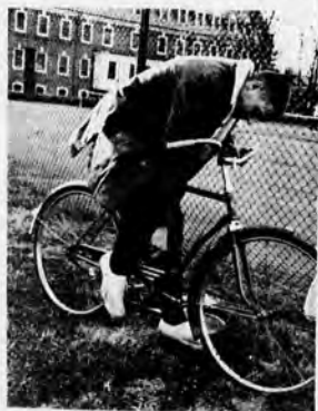
Exasperated SCAB member desperately tugs at pant cuff in attempt to free it from greasy bicycle chain.