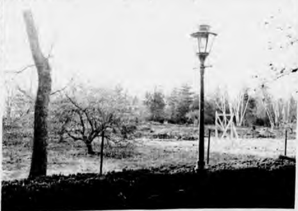
Future site of new library building showing the beginning of construction and end of haven for ardent bird watchers and erstwhile lovers.

"Responsibility, he noted, "is essential for mental growth and maturity. This is almost lacking at the university where (Continued to Page 3)