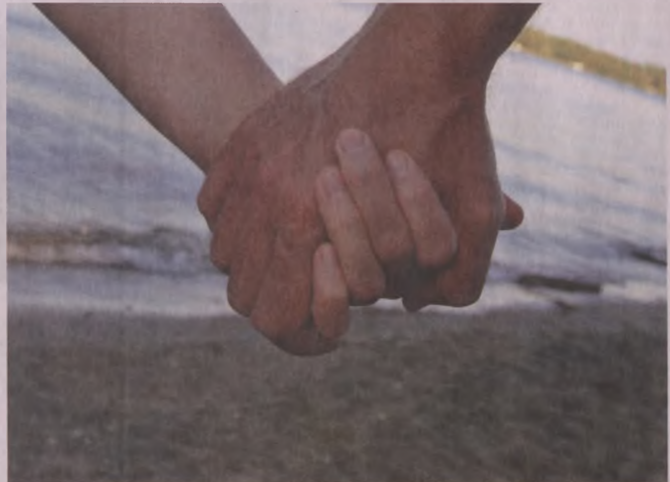
Gender-neutral prefixes and their importance.

When in doubt of a person's preferred pronouns or prefixes, ask them.