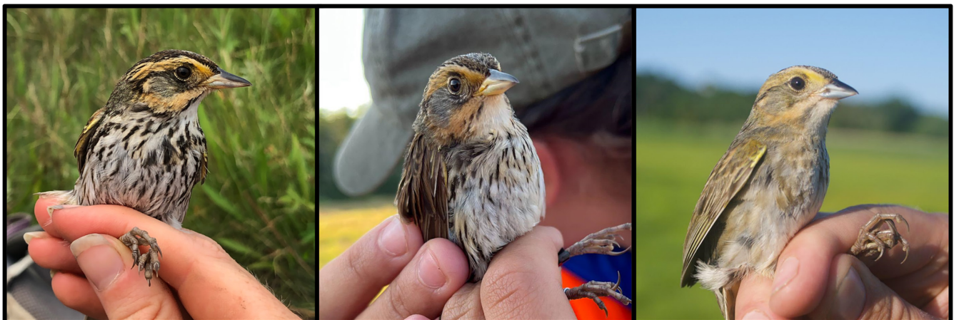
FIGURE 2 Photos of the Saltmarsh Sparrow females from Mendall Marsh, ME (left) and Milbridge, ME (center), and of the male Nelson's Sparrow from Cape Cod, MA (right).

On 1 August 2022, we found a nest in a similar area of the marsh with four nestlings aged as 2 days old. The nest had no