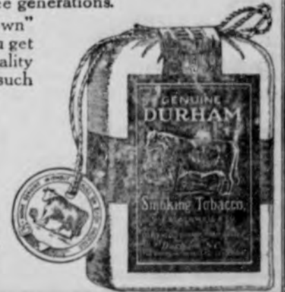
THE AMERICAN TOBACCO COMPANY