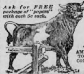
Ask for FREE package of "papers" with each 5c sack.

Only by "rolling your own" with "Bull" Durham can you get a cigarette with the individuality and personality that give such perfect, lasting satisfaction.