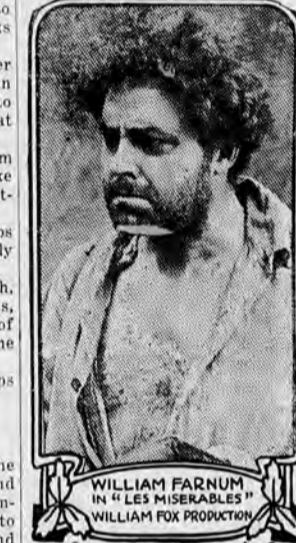
Victor Hugo's immortal masterpiece in 8 reels, Friday, April 4th. Two showings, 7.00 and 8.30. Admission, 22 cents. NEWARK OPERA HOUSE.