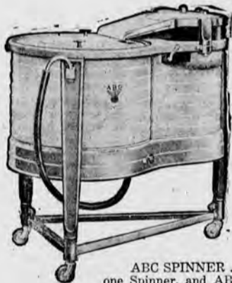
ABC SPINNER . . . There is but one Spinner, and ABC builds it. A complete home laundry unit which washes, rinses, blues and damp-dries the clothes.

The savings with ABC home laundry equipment are more than enough to meet the small payments on the most convenient terms ever offered.