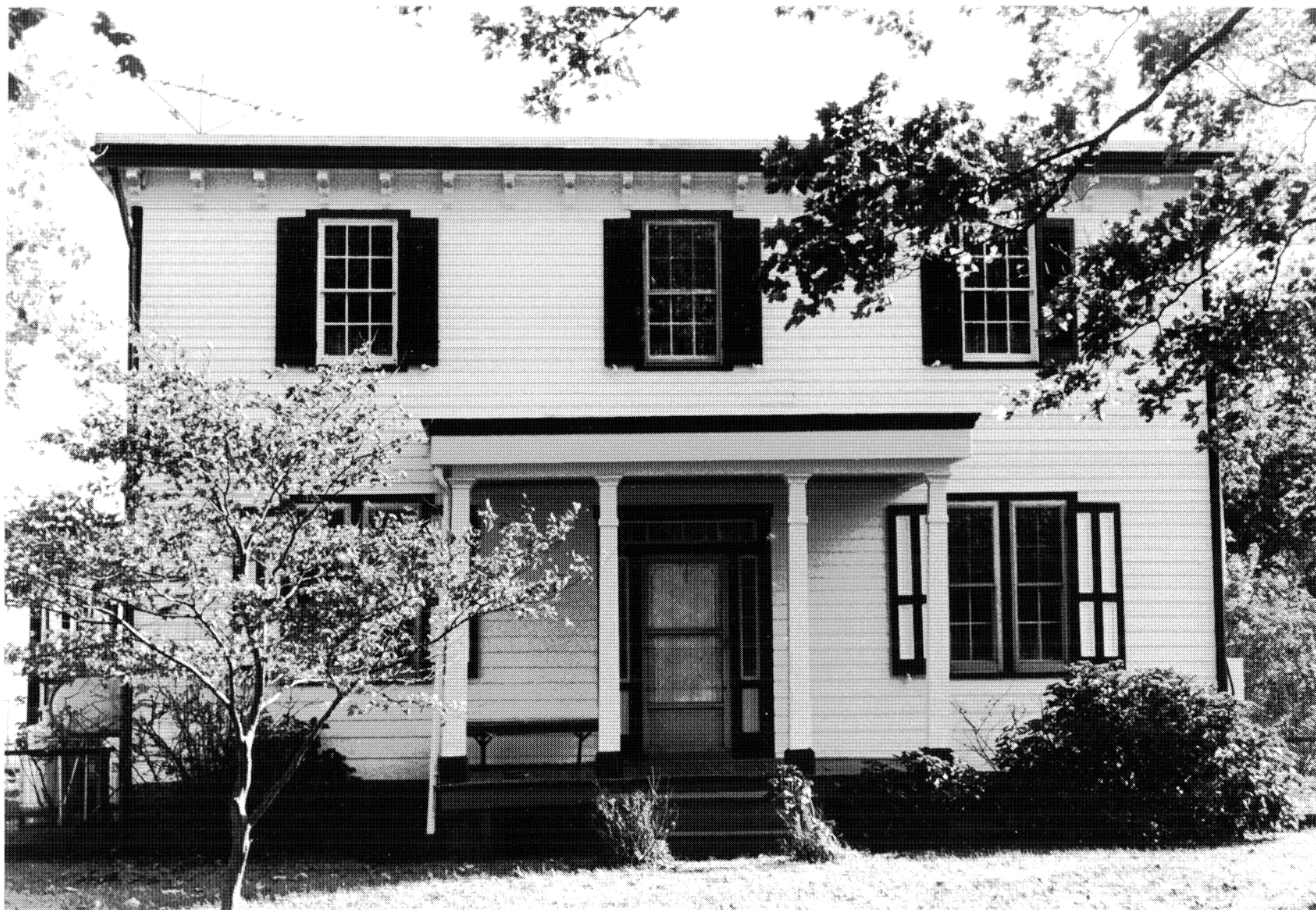
McDonnell House N-567