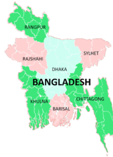
Figure B1: Division-wise administrative map of Bangladesh.