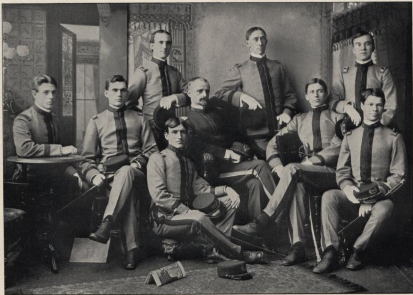
OFFICERS OF THE BATTALION.