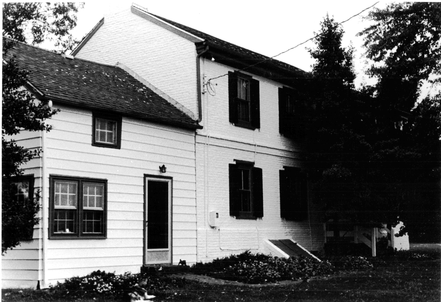
Curran House 10-3944