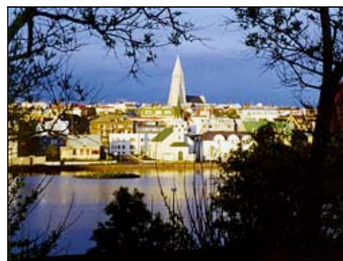
Reykjavik under the midnight sun