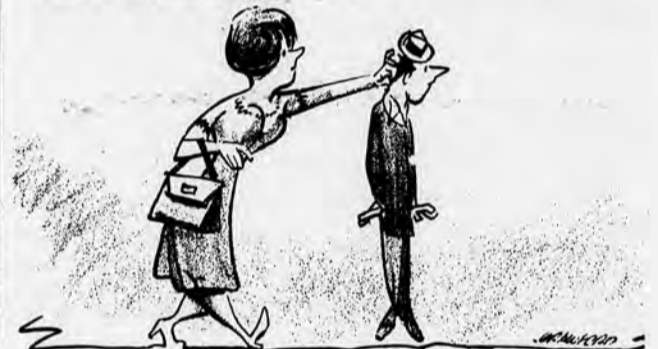
She carried me to a chic French restaurant

It all started the very first day I arrived at college. I was walking across the campus, swinging my paper valise and singing traditional airs like Blue Tail Fly and Death and Transfiguration , when all of a sudden I ran into this here collegiate-looking fellow with a monogram on his breast pocket. He asked me was I a freshman. I said yes. He asked me did I want to be a BMOC and the envy of all the in crowd. I said yes. He said the only way to make these keen things happen was to join a fraternity. Fortunately he happened to have a pledge card with him, so he pricked my thumb and I signed. He didn't tell me the name of the fraternity or where it is located, but I suppose I'll find out when I go active.