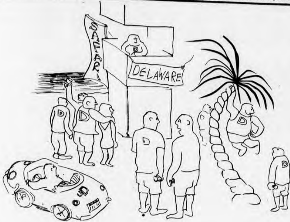
"I don't know about you, but I came here to get away from Delaware!"

Attention all students in need of financial aid: Applicants are now being accepted for those students interested in working in the student center boiler room next year.