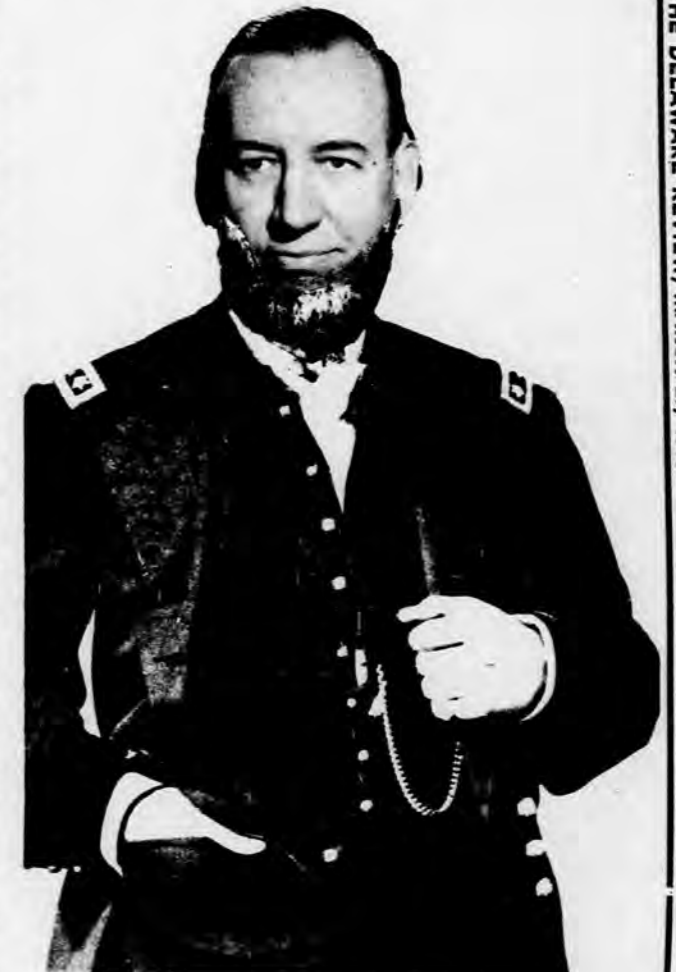
Eventually intercollegiate war may develop its own group of heroes and All-American warriors.

Intercollegiate War is a harmless, thrilling and realistic game of no contact and little possibility for injury (other than tripping over roots, insect bites, etc.). It is expected that the game will begin as a contest of the informal, "pick-up" type, then become an actual intercollegiate contest. This is the dawn of a new age of athletics. Aggressors of the world, unite! You have nothing to expend save aggressive energy!