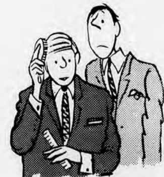
5. I doubt that--after all, 90 per cent of the women who get married today have children. And, on the average, they have all their children before they're 27.

All my life I've shirked responsibility. Have a ball, enjoy yourself--that's my motto. Now, in two minutes, you've given me a wife and who knows how many children to take care of. What should I do? Where do I begin?