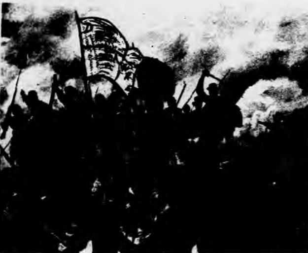
Here Delaware defenders beat back the onslaught of the enemy in a mock battle.

Any number can play. However, in formal intercollegiate struggles the sides shall be restricted to fifty (50) men on each team. It is suggested that the war be conducted by a general staff of five, directing the activities of five nine-man squads.