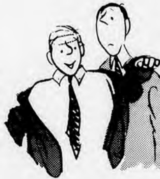
4. Yes, indeed. What's more, you'll have children to consider.