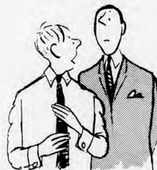
3. Hardly likely, since 93 per cent of all men and women get married.

I may just decide to lead the bachelor life.