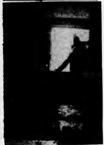
So that's how they got into the girls dorm.

The Peace of Geneva effected at last appears to have temporarily claimed the spark that so possibly might have become WW III. The title was graciously reneged by both contenders and was generously bestowed upon the author of the peace - Mr. Kasavubu, who replied softly, "Sic Transit." (Translated from the African - That's the way it goes.)