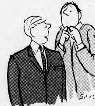
6. First relax. Then look into some good insurance... like Living Insurance from Equitable. It gives the kind of protection every family should have. Helps you save for the future, too. And don't worry--your chances for a happy family life are very good.

All my life I've shirked responsibility. Have a ball, enjoy yourself--that's my motto. Now, in two minutes, you've given me a wife and who knows how many children to take care of. What should I do? Where do I begin?