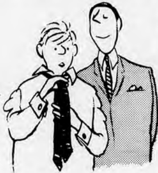
2. That's fine when you have no responsibilities. But chances are you'll have a wife to think about soon.

My philosophy is to live from day to day.