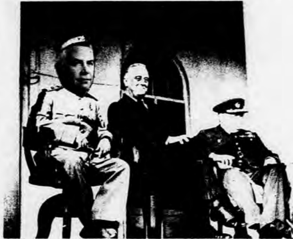
Peace and armistice conferences are as much a part of intercollegiate war as they are a part of "live" war.