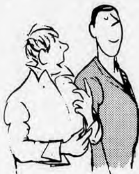
1. With graduation coming up, looks like we'll have to start thinking about the future.

mented, "We'll be glad to play them. I'll certainly feel more comfortable going up against the faculty than LaSalle or St. Joseph's. As you know, we only schedule each of those two teams every time Haley's Comet comes around."