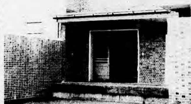
Site of last year's festivities. Garbage pickup was rescheduled so as not to coincide with affair.