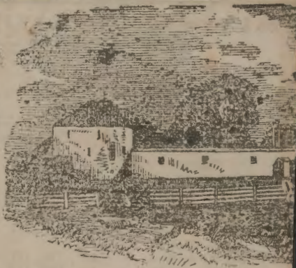
Living Home for Sick or Well.

HARD TIMES. —No doubt there is but few persons in our Country, who have not felt the pressure of our present National troubles, and let the largest part of our Mechanics and Laborers be deprived of their weekly earnings, and then comes Hard Times in good earnest. such is the case with a large body of our population.