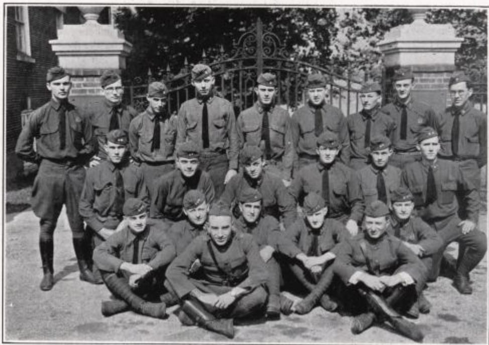
CADET OFFICERS OF THE 1922-1923 BATTALION