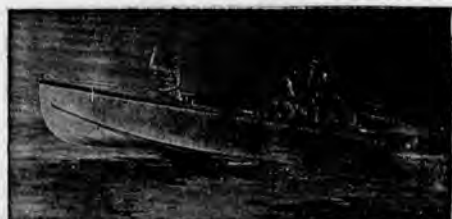
14 ft. Sea Queen, Popular leader of the Trojan fleet.

Mercury Motors — Fleecraft and Trojan Boats Roberts Kit Boats — Haggerty Sea Shells 12 and 14 Sportsman — 14 ft. Angler 12-14-16 ft. Sea Queen Plasti-Craft Boats Boat Trailers Outboard Parts, Repairs, and Service