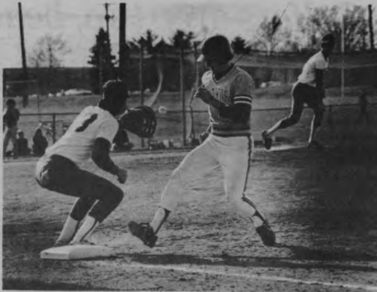
Review Photo by Terry Bialas

CORRECTION - In the April 17 issue of The Review, Chuck Coker's name was inadvertently spelled Choker. We regret the error.