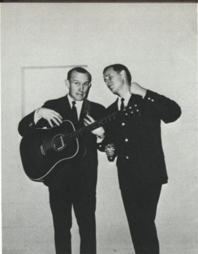
The Senior Class, the class of '64, sponsored the Smothers Brothers Concert with the Junior Class in November. The second semester the class was busy with plans for graduation. The class sold announcements and planned the Senior Party which was held at the Hotel DuPont the night before graduation.

The Class of 1965 co-sponsored the Smothers Brothers Concert and the Fats Domino Concert. The Juniors gave a dinner for the outstanding top twenty-five in their class. They have also been working on the University Evaluation, the academic honor system and their senior weekend.