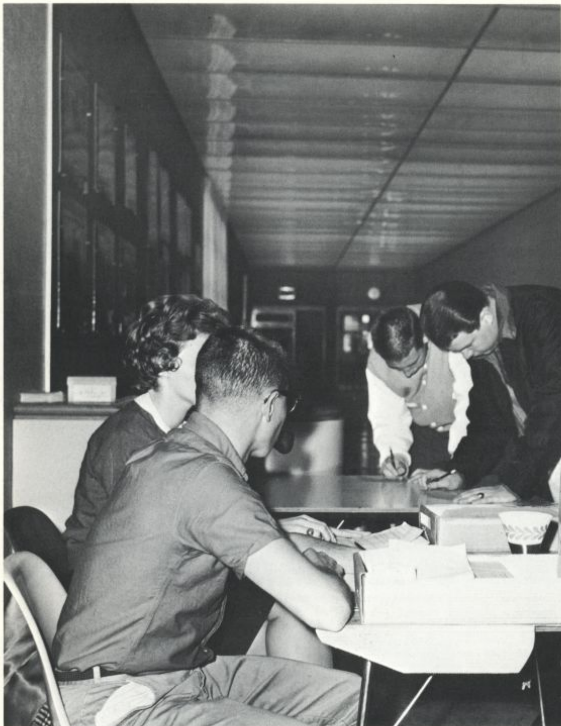
STUDENT GOVERNMENT ASSOCIATION ELECTIONS