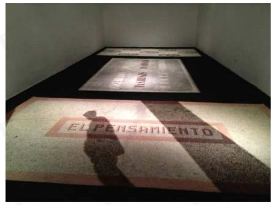
Carlos Garaicoa, Fin de Silencio , 2012. Tapestries of cotton, wool, trevia-cs, lurex, and mercerized cotton yarn. Various dimensions. Gallería Continua, San Giagnano, Italy; Centro de Arte Contemporáneo Wifredo Lam, Eleventh Havana Biennial, Havana, Cuba.

prevailed in Carlos Garaicoa's floor tapestries embedded with writing and slogans.