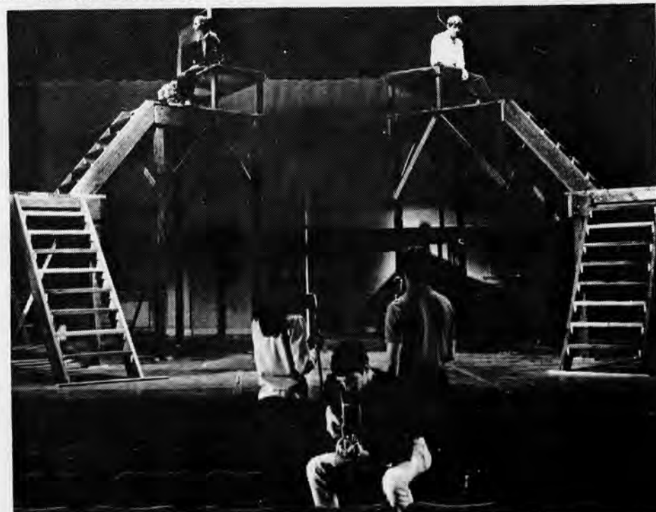
SENSATIONAL Searing Sound waves split the Sombre silence as "Theatre Piece No. 1" seizes the stage.

Th only two performances of "Theater Piece No. 1," two weeks ago, both received standing ovations. Tickets are available at the door, or may be reserved at the Mitchell Hall box office. Admission is $1 for faculty and the general public. Student admission is free.