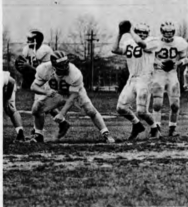
HUT, HUT, HUT Hen Quarterbacks perfect their passing technique in a recent scrimmage session. The team will conclude spring drills Saturday, May 4 with the annual Blue-White Game at Delaware Stadium.