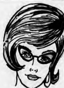
"GLASSES THAT GRACE THE FACE"