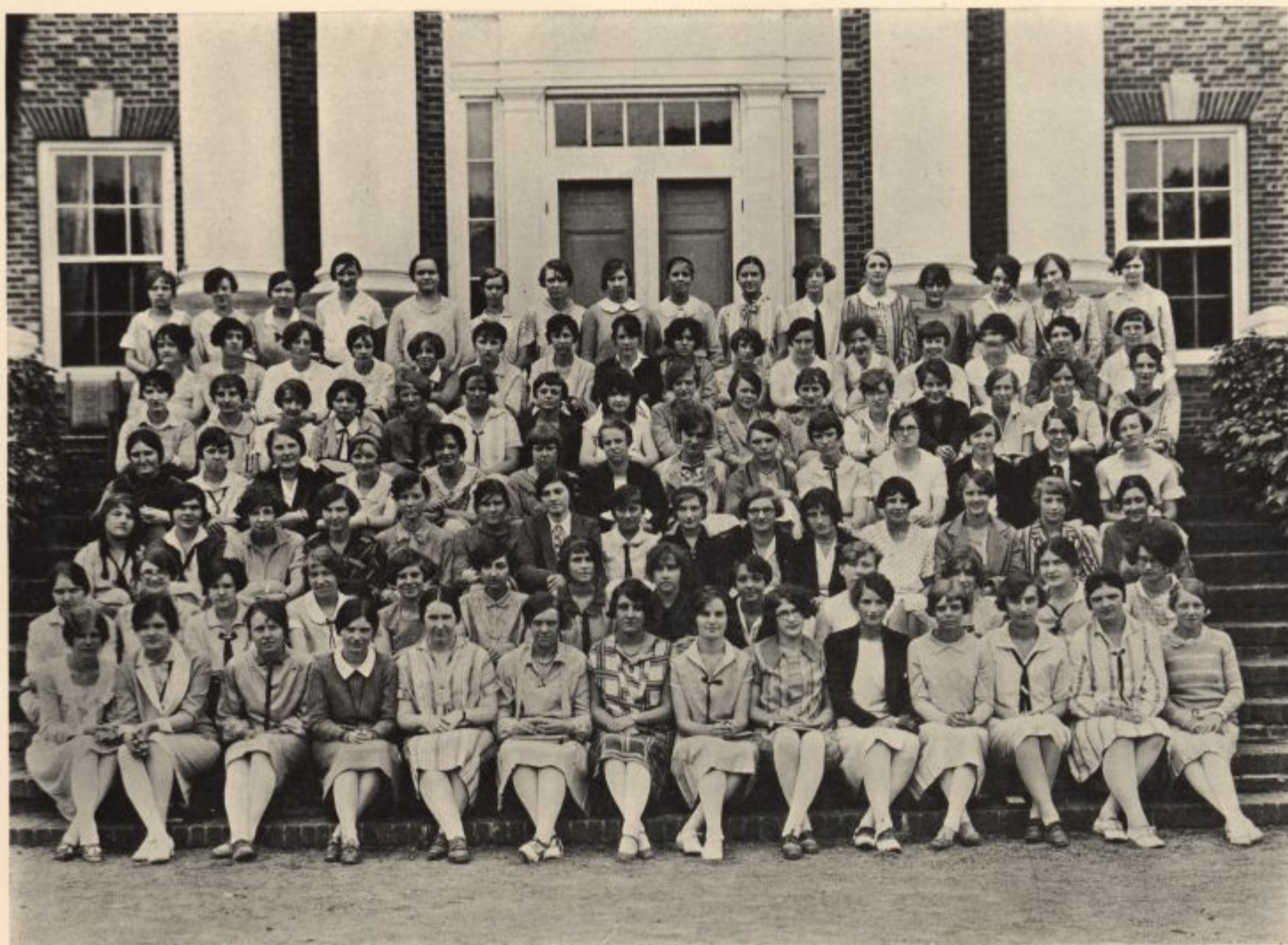
THE CLASS OF 1931