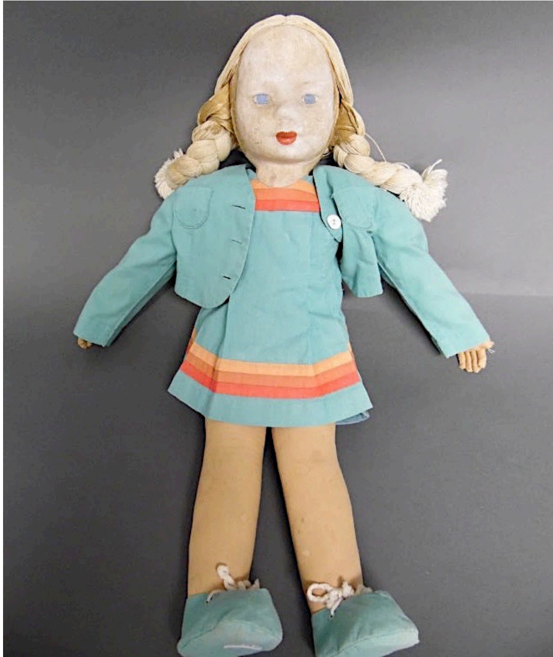
Figure 5 Example of a doll produced by the Milwaukee Handicraft Project, “American Doll,” (M2015.024.001 WPA Doll), Special Collections, Milwaukee County Historical Society, Milwaukee, WI