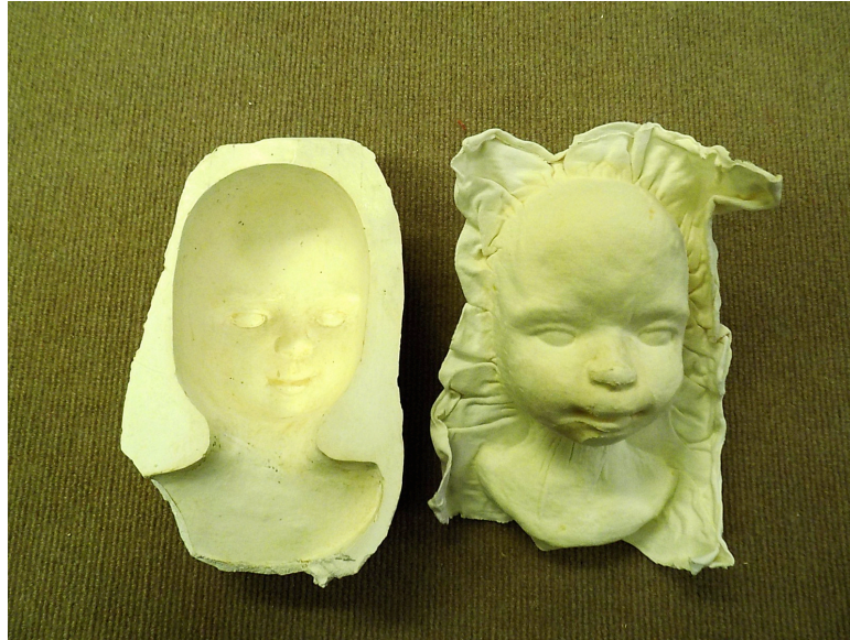
Figure 12 Unpainted 22-inch doll face, “Doll face and mold,” Special Collections, Milwaukee County Historical Society, Milwaukee, WI, courtesy of the Milwaukee County Historical Society.