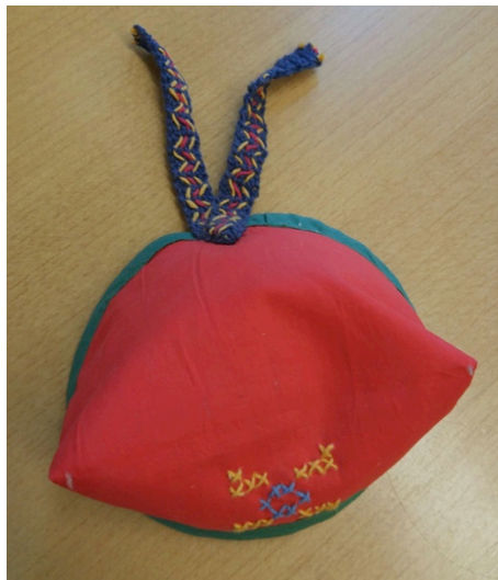
Figure 28 Hat from “Norwegian Girl,” Jack Russell Memorial Library, Hartford, WI, courtesy of the Jack Russell Memorial Library.

Her jacket, hat with “streamers,” and belt are perhaps the most striking and unique aspect of her “costume.” Clarke designed a two-cornered, M-shaped hat, with a peak on either end of the peak of the cap. The workers embellished this hat with a grass green trim at the hemline and cross-stitching in yellow and blue on the front. They completed the hat with a final touch – two crocheted “streamers” in dark blue with red and yellow zigzags secured by hand at the nape of the neck. The workers crocheted a belt with the same design as her streamers, albeit secured with a snap like the other doll clothing. Her matching red jacket with green trim featured yellow cross-stitching that echoed this design. Finally, this doll wore a blue denim ankle-length skirt over her blouse, also secured with snaps. 154 Only the Norwegian Girl included these designs.