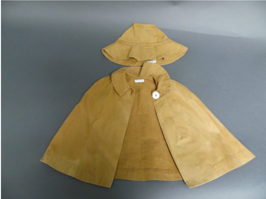
Figure 19 WPA Doll's Clothing (M2015.025.002A-B), Special Collections, Milwaukee County Historical Society, Milwaukee, WI