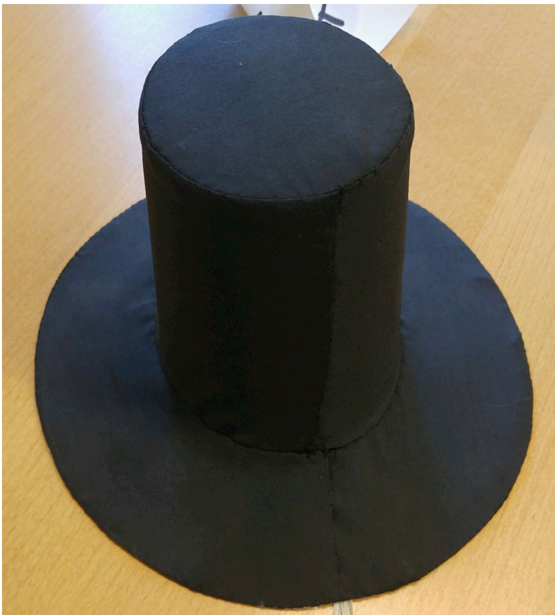
Figure 32 Hat from “Welsh Girl,” Jack Russell Memorial Library, Hartford, WI, courtesy of the Jack Russell Memorial Library.