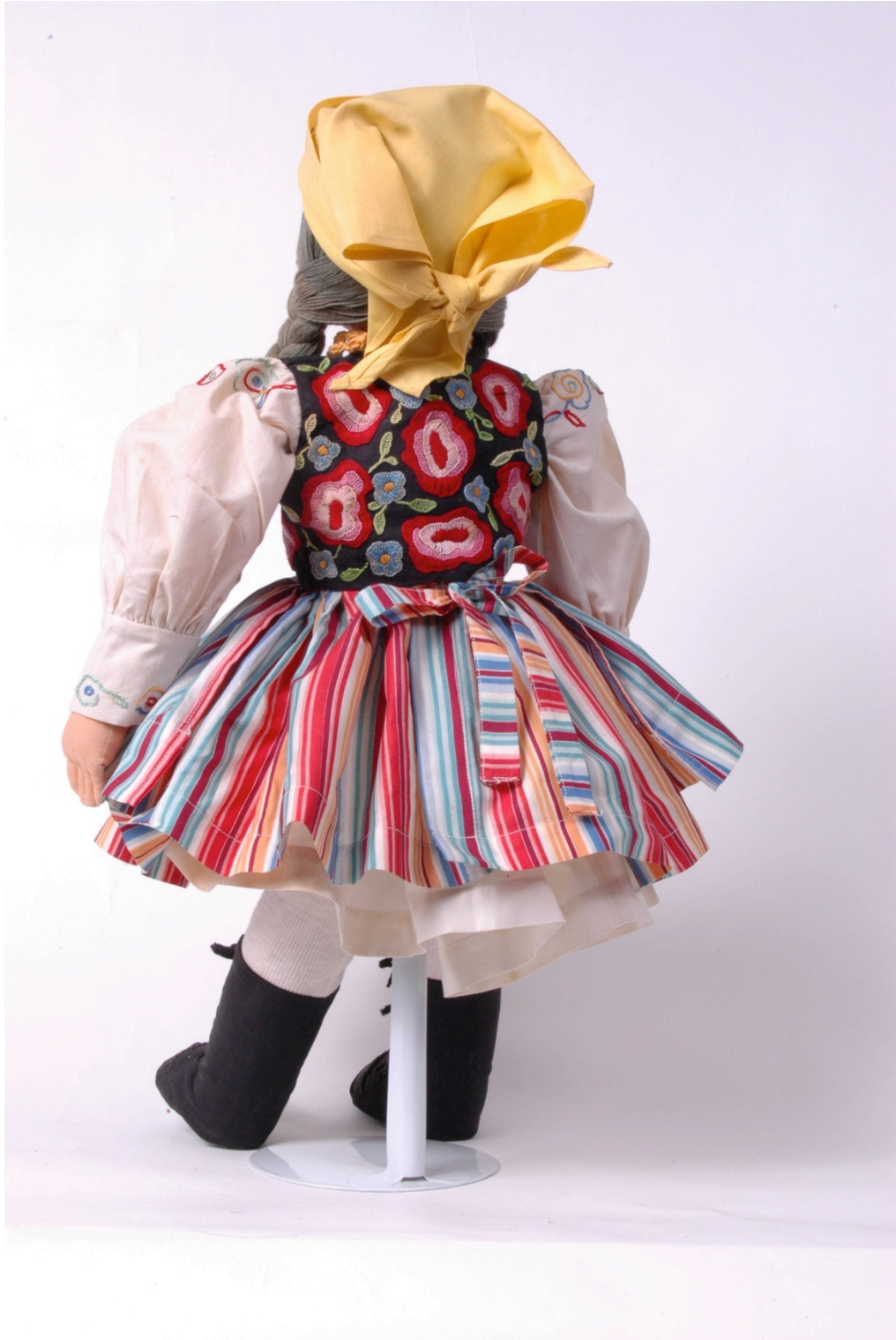
Figure 25 “Polish Girl,” private collection, courtesy of Dr. Charles Waisbren.