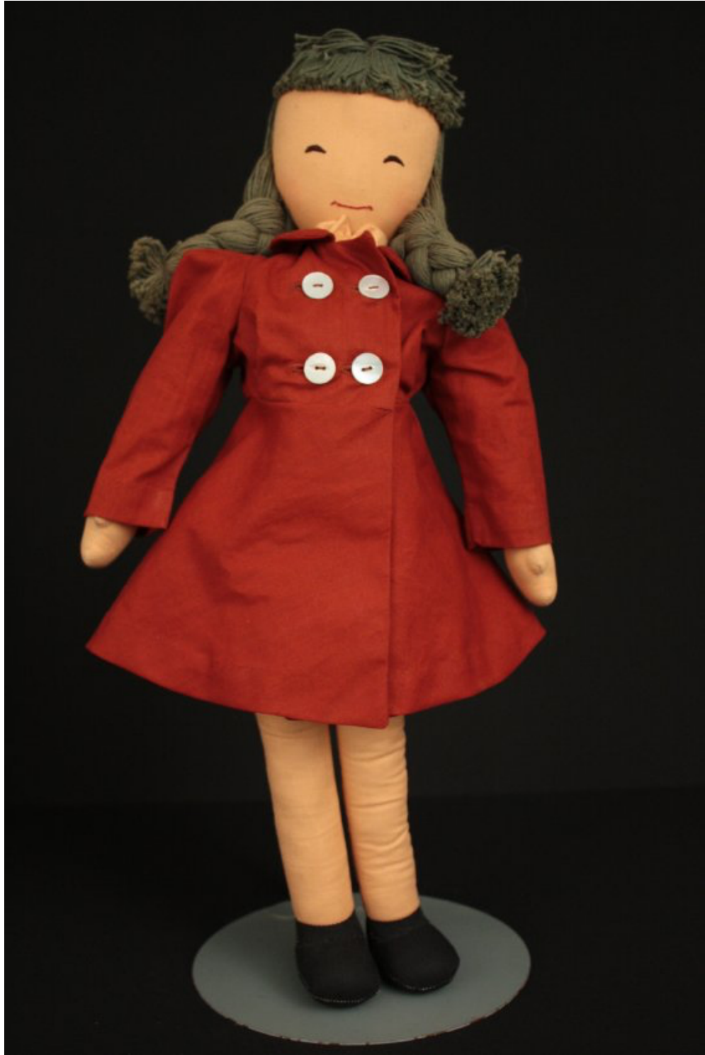
Figure 8 Patsy, “Children’s Doll with Red Raincoat” (M2005.027.003, W.P.A. Doll), Special Collections, Milwaukee County Historical Society, Milwaukee, WI