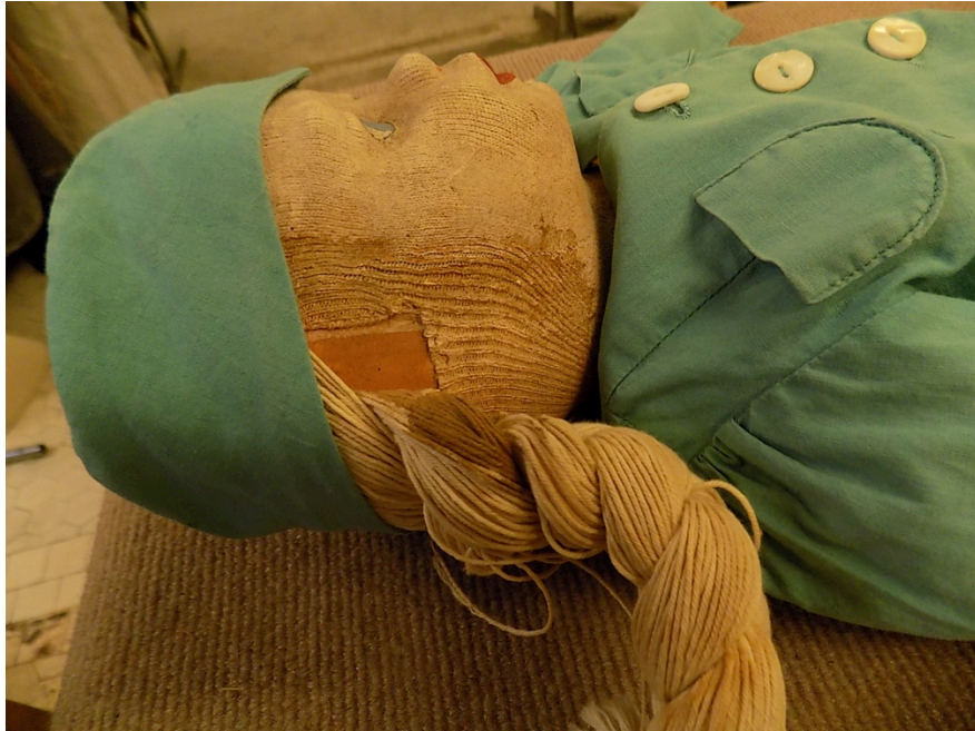
Figure 14 Close-up of twenty-two inch doll hair with evidence of glue remnants once used to secure the wig to the side of the face, “American Girl” (M2015.024.001 WPA Doll), Special Collections, Milwaukee County Historical Society, Milwaukee, WI

Women had to be careful as they secured this wig as well, using a combination of glue and thread that closely matched the color of the hair. The liquidity of the glue caused it to collect within the ridges of the balbriggan fabric of the face. If the women applied too much it gathered in large visible globs; too little and the hair would not stay in place, easily pulled away leaving cracked residue where the hair pulled away. 122 Further, the thread used to secure the hair, particularly the ends of the braids, was very fine and nearly matched the color of the yarn for used the hair. Workers assigned to this task had to look