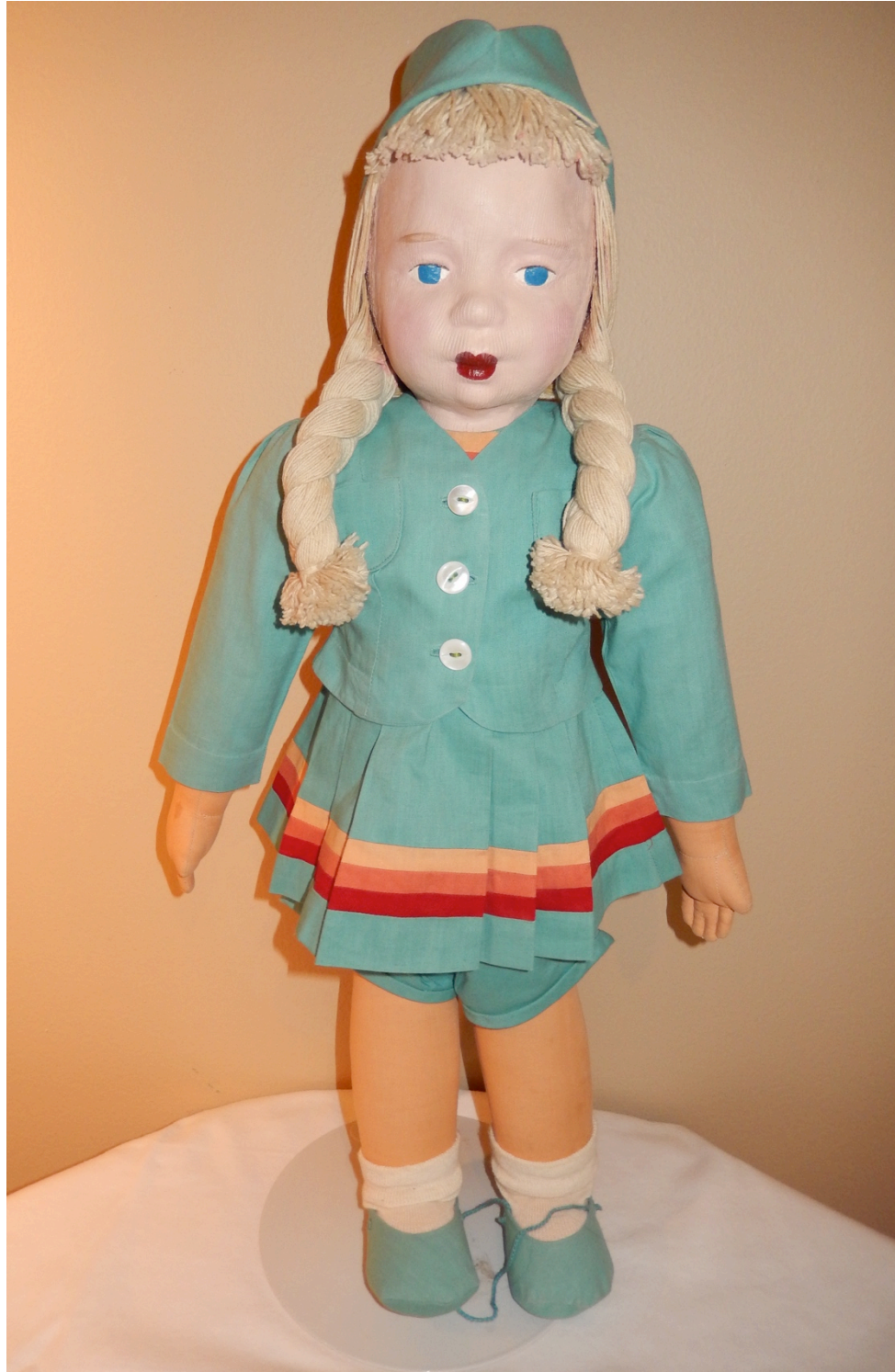
Figure 11 American doll, “Navy Girl,” private collection, courtesy of Dr. Charles Waisbren.