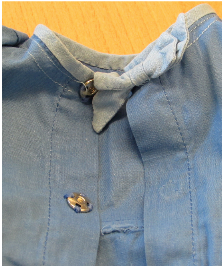
Figure 18 Close-up of fastenings on the Milwaukee Handicraft Doll dresses, “American Girl” WPA Dolls, Jack Russell Memorial Library, Hartford, WI