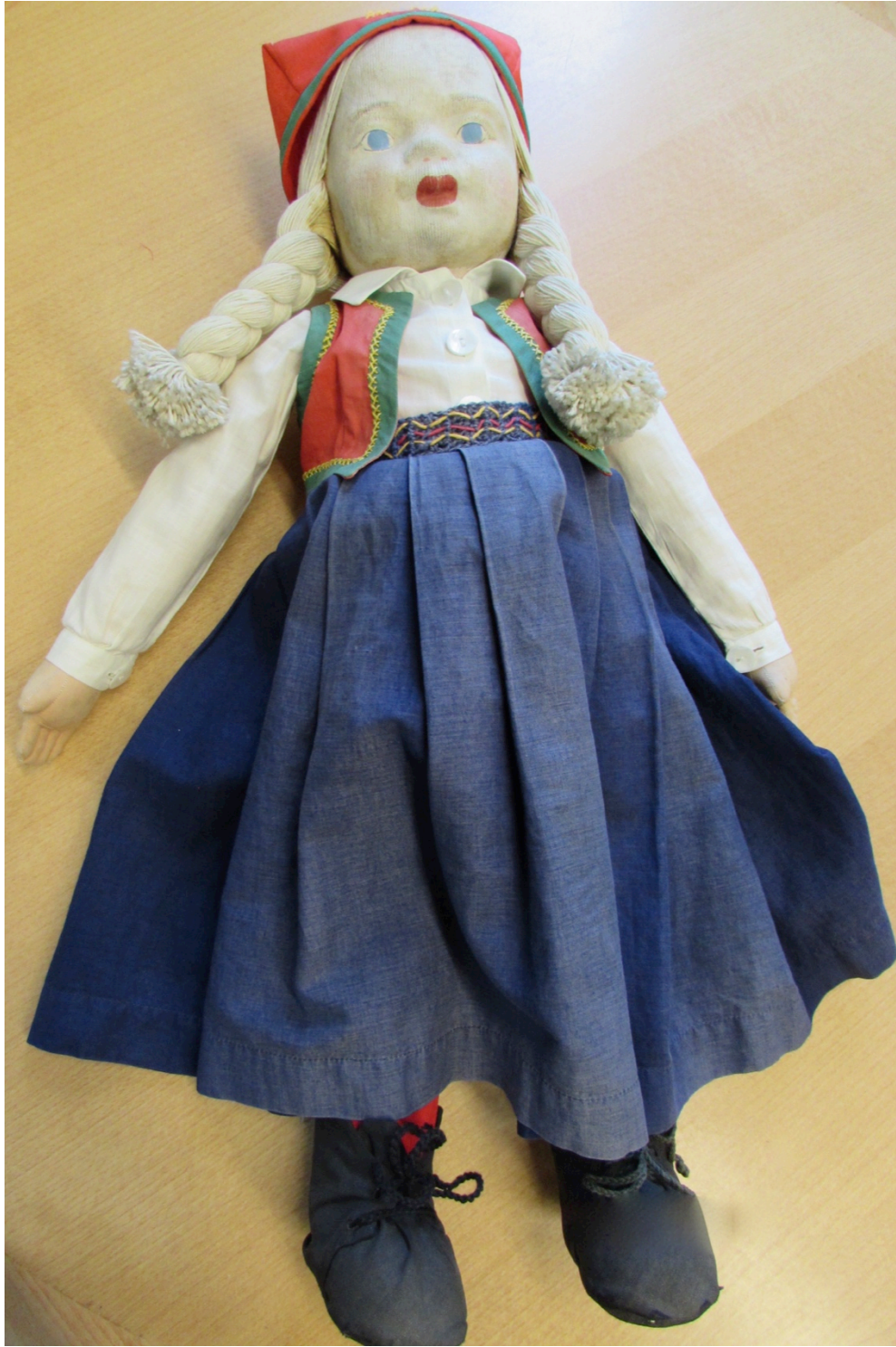
Figure 27 “Norwegian Doll,” Jack Russell Memorial Library, Hartford, WI