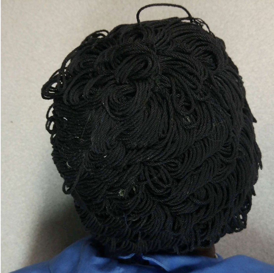
Figure 34 Close up of “Negro Girl” hairstyle, Milwaukee Handicraft Project Collection, Milwaukee Public Museum, Milwaukee, WI, courtesy of the Milwaukee Public Museum.

The core pedagogical intent of these dolls remained present throughout the designs – snaps, buttons, and laces secured almost every piece of clothing so that children could learn how to dress themselves. However, Clarke and the women working on the factory floor of the Milwaukee Handicraft Project pushed the intended pedagogical