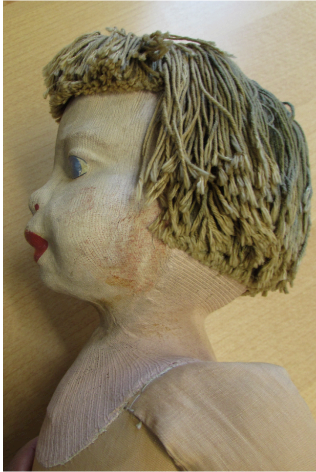
Figure 15 Close up of painted doll face attached to the doll body, “American Girl,” WPA Dolls, Jack Russell Memorial Library, Hartford, WI, courtesy of the Jack Russell Memorial Library.

carefully at their work to keep track of where they wrapped the thread. From measurement and weaving to gluing and sewing, the wig alone combined many different tasks that could each affect the quality of the final toy.