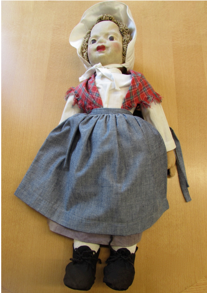
Figure 31 “Welsh Girl,” Jack Russell Memorial Library, Hartford, WI, courtesy of the Jack Russell Memorial Library.

doll resisted easy categorization. Perhaps, in this respect, she is the most foreign out of the many doll offerings of the Milwaukee Handicraft Project.