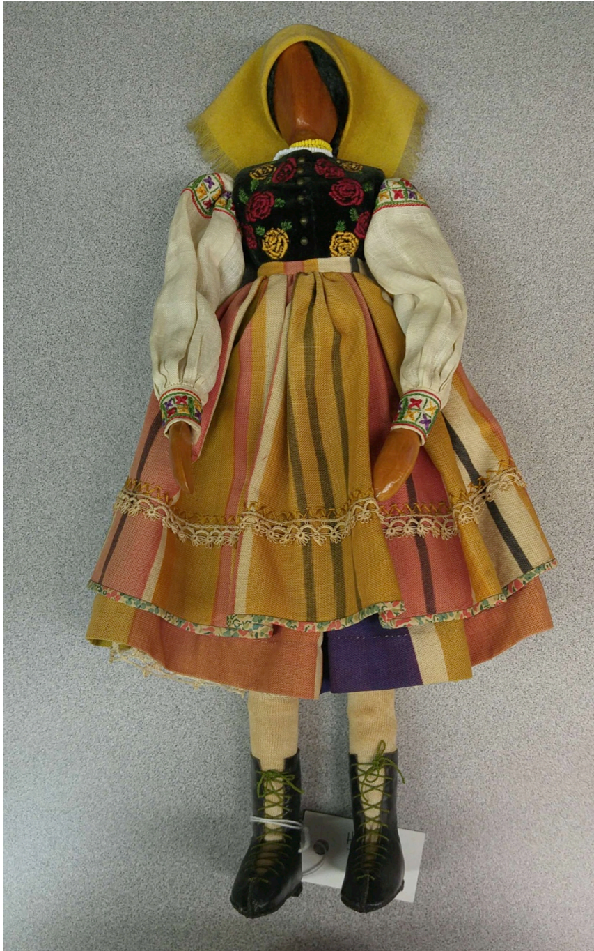
Figure 26 Manikin of the Polish Female costume produced by the Milwaukee Handicraft Project in miniature, “Polish Female (H57871/29244),” WPA Milwaukee Handicraft Project Collection, Milwaukee Public Museum, Milwaukee, WI, courtesy of the Milwaukee Public Museum.