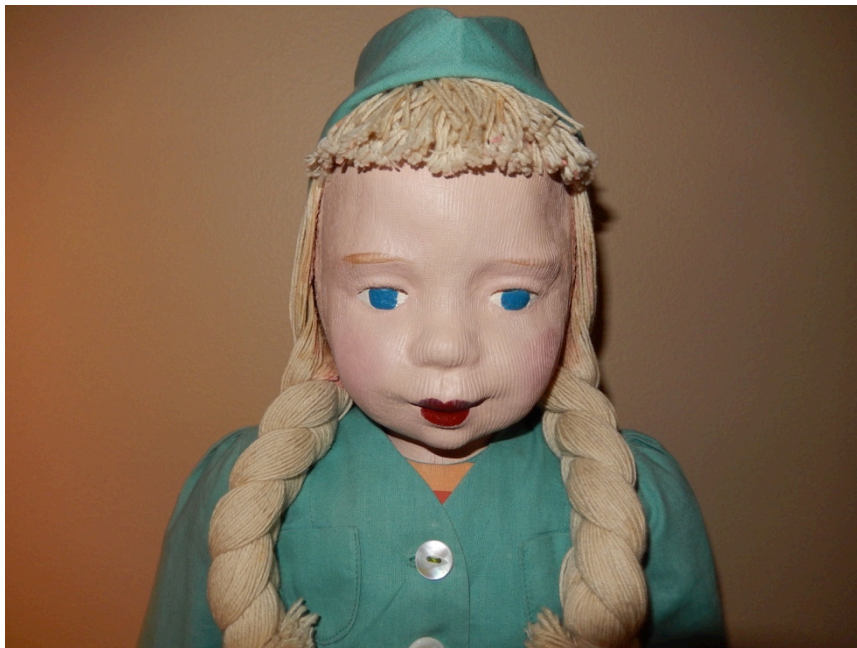
Figure 13 Close-up of painted 22-inch American doll face, “Navy Girl,” private collection.