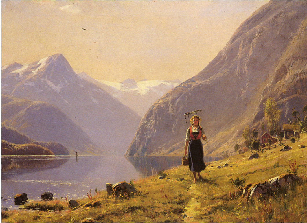
Figure 29 By the Fjord , Hans Dahl, 1937, public domain.

Clarke likely drew inspiration for the outfit from the national dress of Norway. The dolls design bore a strong resemblance to other contemporary images of Norwegian girls from the early-to-mid twentieth century. Artists such as Hans Dahl, a Norwegian painter famed for his landscapes of women in traditional dress, shared Clarke's distinct attention to the red and green jacket paired with a blue skirt. The precise source for her information is unknown; perhaps like the Polish Girl, the designer-foremen in the costume department shared the designs for a Norwegian costume with Clarke. Or perhaps Clarke was aware of renderings of traditional Norwegian dress, whether the art of Dahl, an issue of Geographical Magazine , or any number of images of ethnic typologies that circulated in the popular visual culture of the 1930's. Comparing the Norwegian Girl to