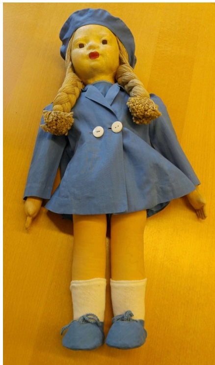
Figure 20 “American Girl,” WPA Dolls, Jack Russell Memorial Library, Hartford, WI

American doll featured a blue hat or headscarf, the workers made her dress, undergarment, and shoes out of the same blue cloth. Their socks were always white and roughly shin-height. Supplemental wardrobes also came with the same ten pieces of clothing. 148 Using child-friendly snaps and buttons, these American dolls still served as pedagogical tools for children to learn how to dress, groom, and care for themselves. Built into this pedagogical design and sold to consumers, however, was a standardized narrative of what American children wore.