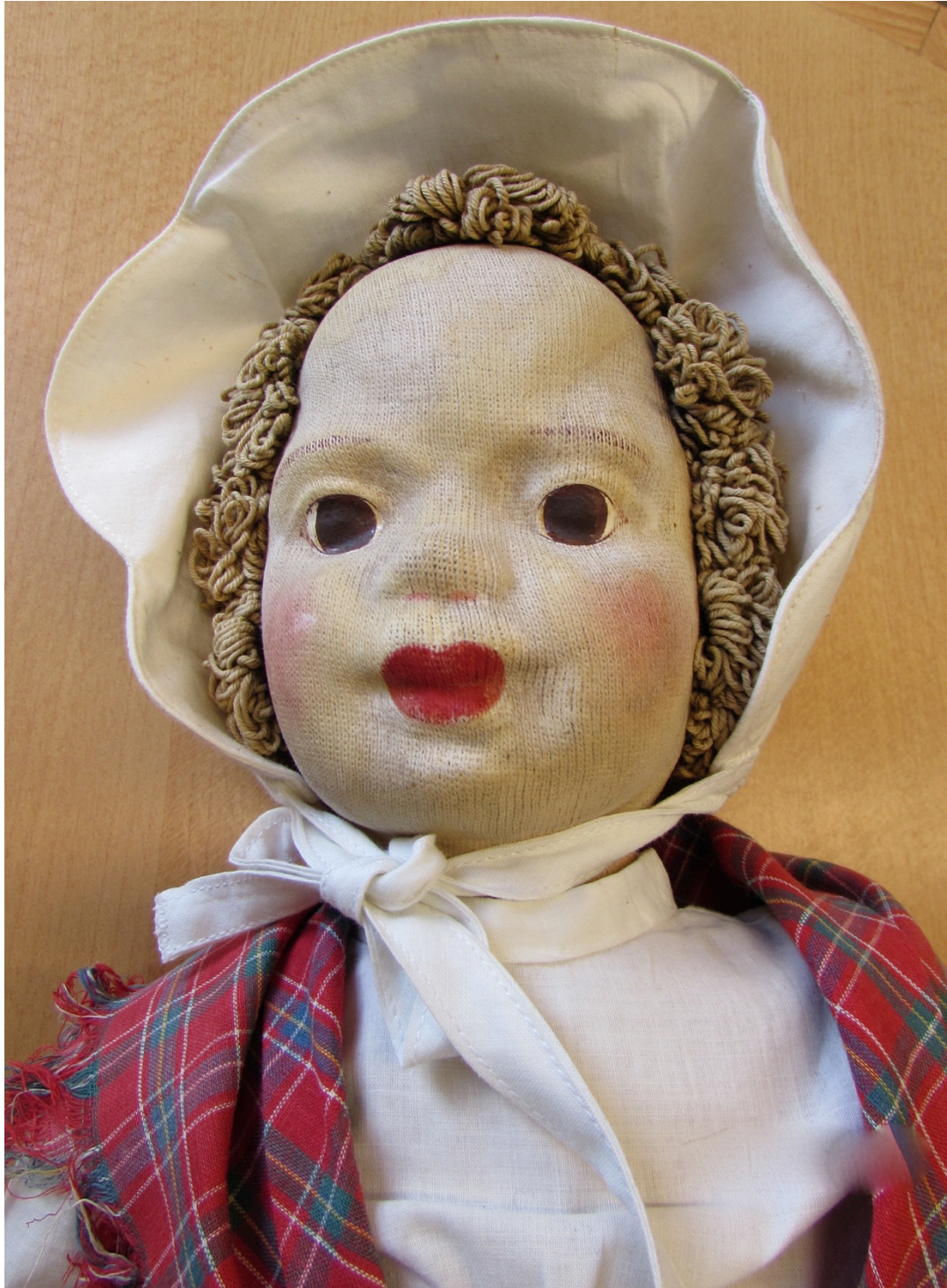
Figure 33 Close up of “Welsh Girl” hair, bonnet, and face, Jack Russell Memorial Library, Hartford, WI