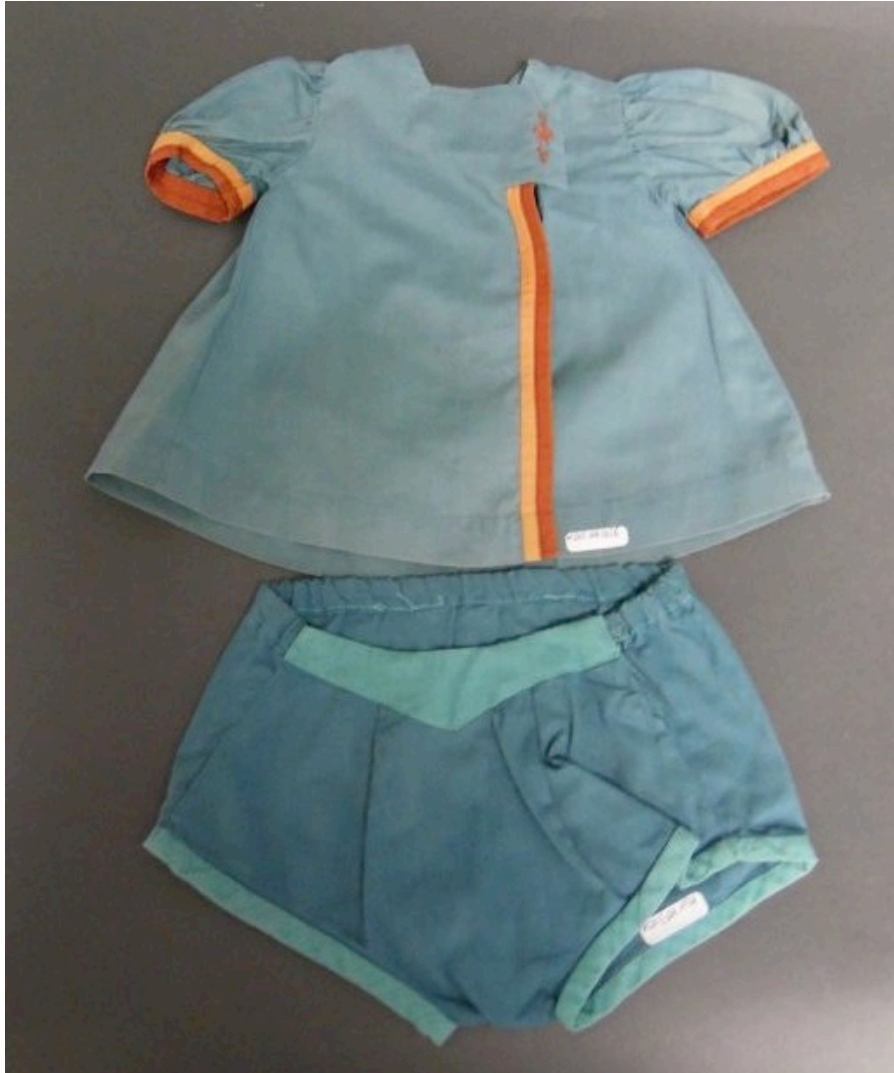
Figure 23 “WPA Doll’s Clothing” (M2015.024.003B), Special Collections, Milwaukee County Historical Society, Milwaukee, WI

Comparison with foreign dolls highlights the ways in which the Milwaukee Handicraft Project developed and marketed a visual vocabulary that defined Americanness through contrast. The workers constructed the heads, hair, and body of Foreign dolls in the same manner as the American dolls. In many cases, the workers used