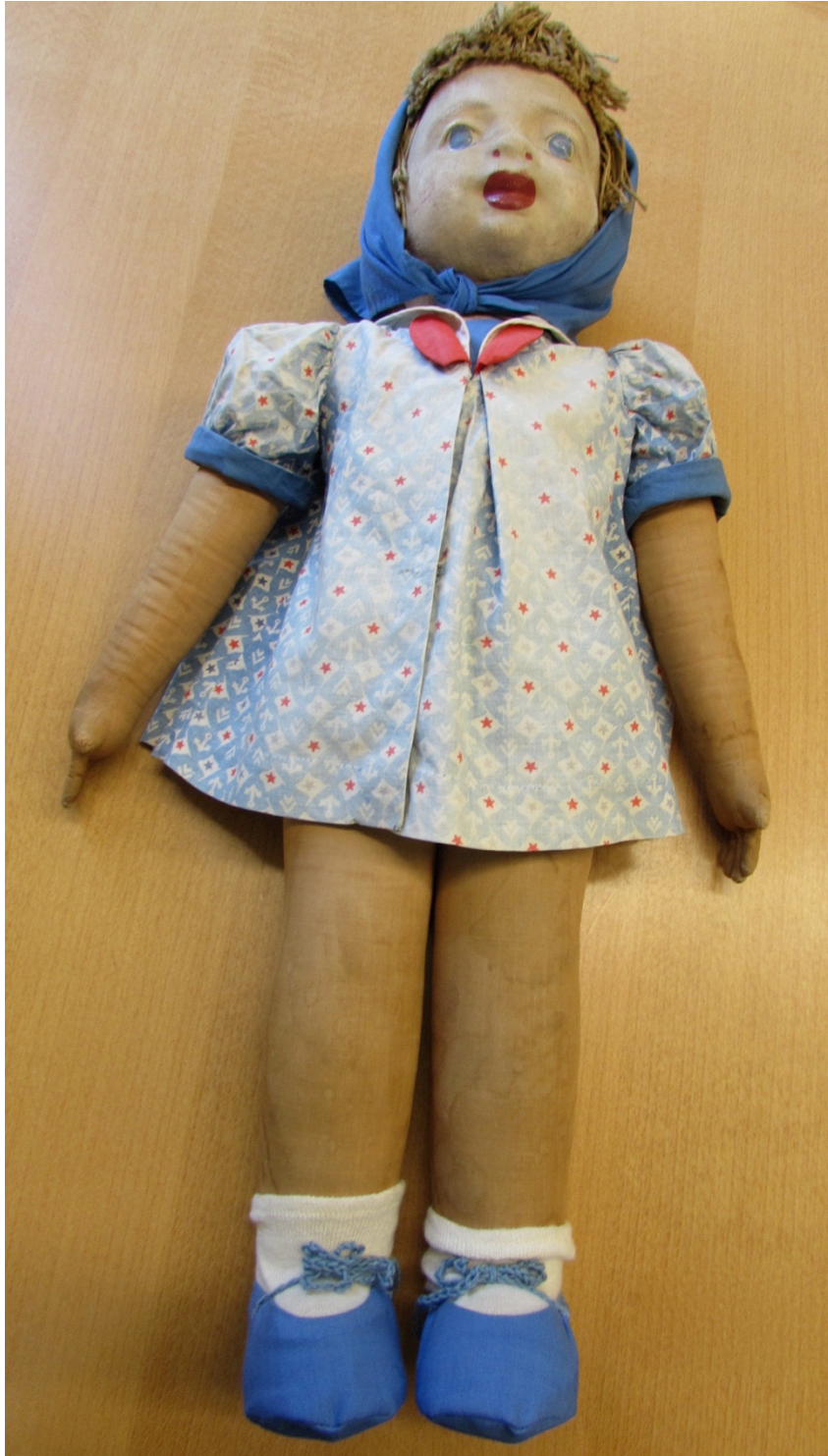
Figure 21 "American Girl," Jack Russell Memorial Library, Hartford, WI