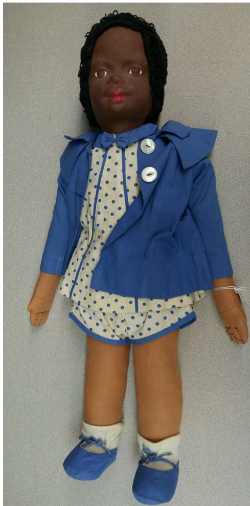
Figure 30 “Negro Girl,” WPA Milwaukee Handicraft Project Collection, Milwaukee Public Museum, Milwaukee, WI, courtesy of the Milwaukee Public Museum.

pronged argument about ethnic origins and whiteness – it materialized the doll designers’ ideas about visually identifiable differences between European ethnic groups while simultaneously developing a material argument about the universality of the human form. Streamlining production - using the same face mold, and body construction for all of these toys – ultimately countered the very visual vocabulary through which the dolls presented Americanness.