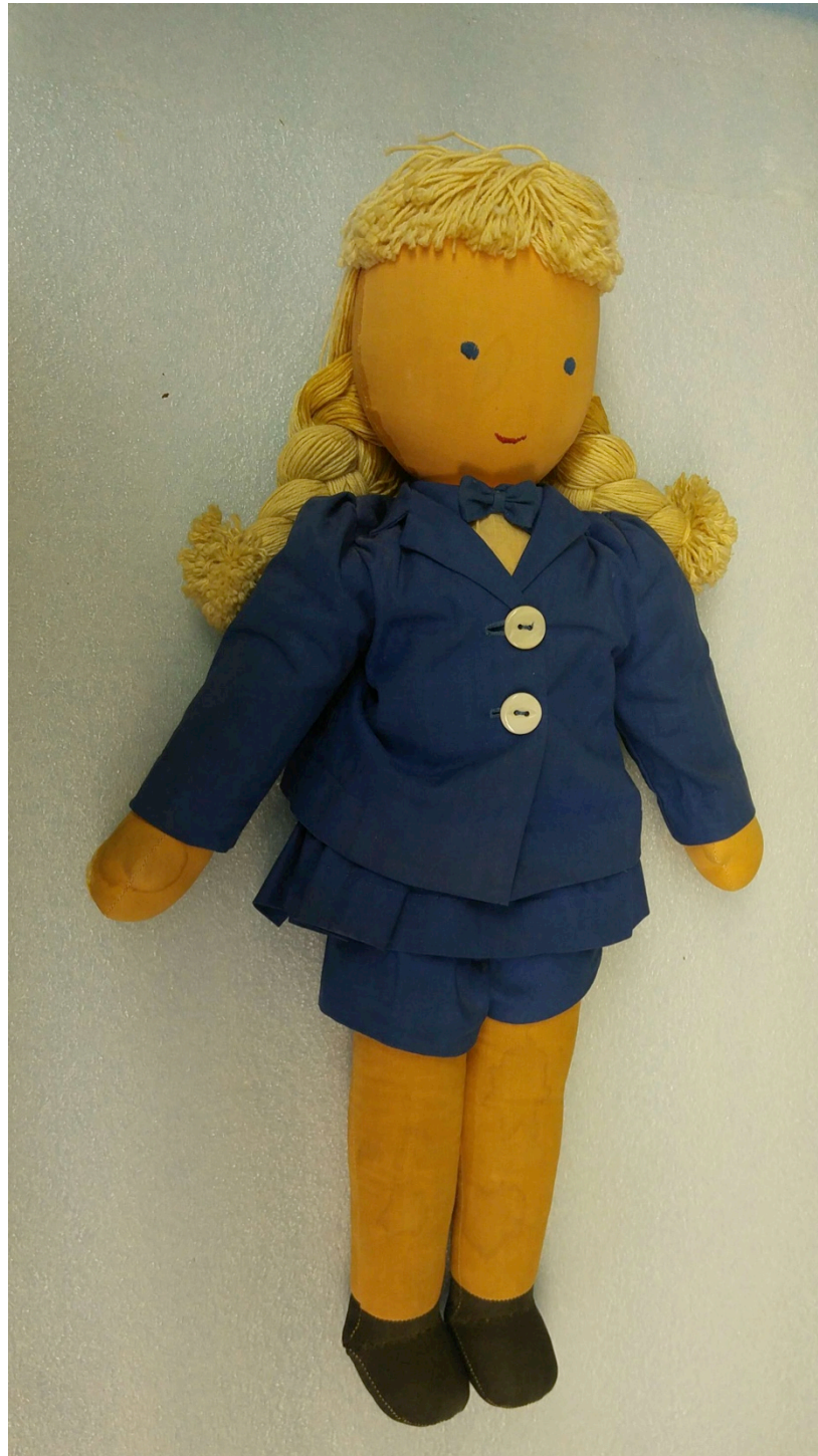
Figure 9 “Blonde twin with bangs and braids,” WPA Milwaukee Handicraft Project Collection, Milwaukee Public Museum, Milwaukee, WI, courtesy of the Milwaukee Public Museum.