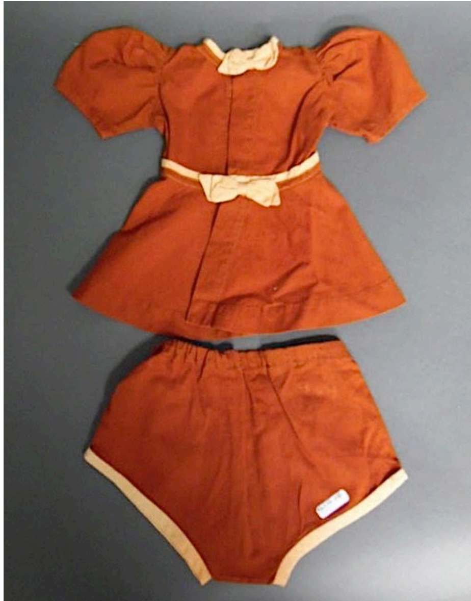
Figure 22 “WPA Doll’s Clothing,” M2015.024.004 A-B, Special Collections, Milwaukee County Historical Society, Milwaukee, WI, courtesy of the Milwaukee County Historical Society.