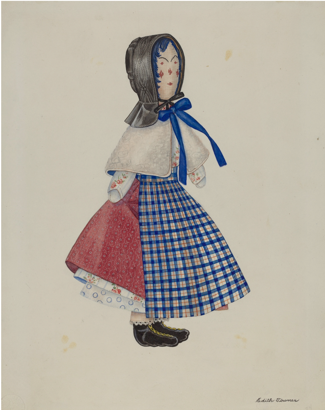
Figure 4 Example of a doll drawing from the American Index of Design contemporary with the Milwaukee Handicraft Project, doll, "Molly Bentley," 1936, watercolor, graphite, and pen and ink on paper, Index of American Design, 1943.8.8135, courtesy of the National Gallery of Art.