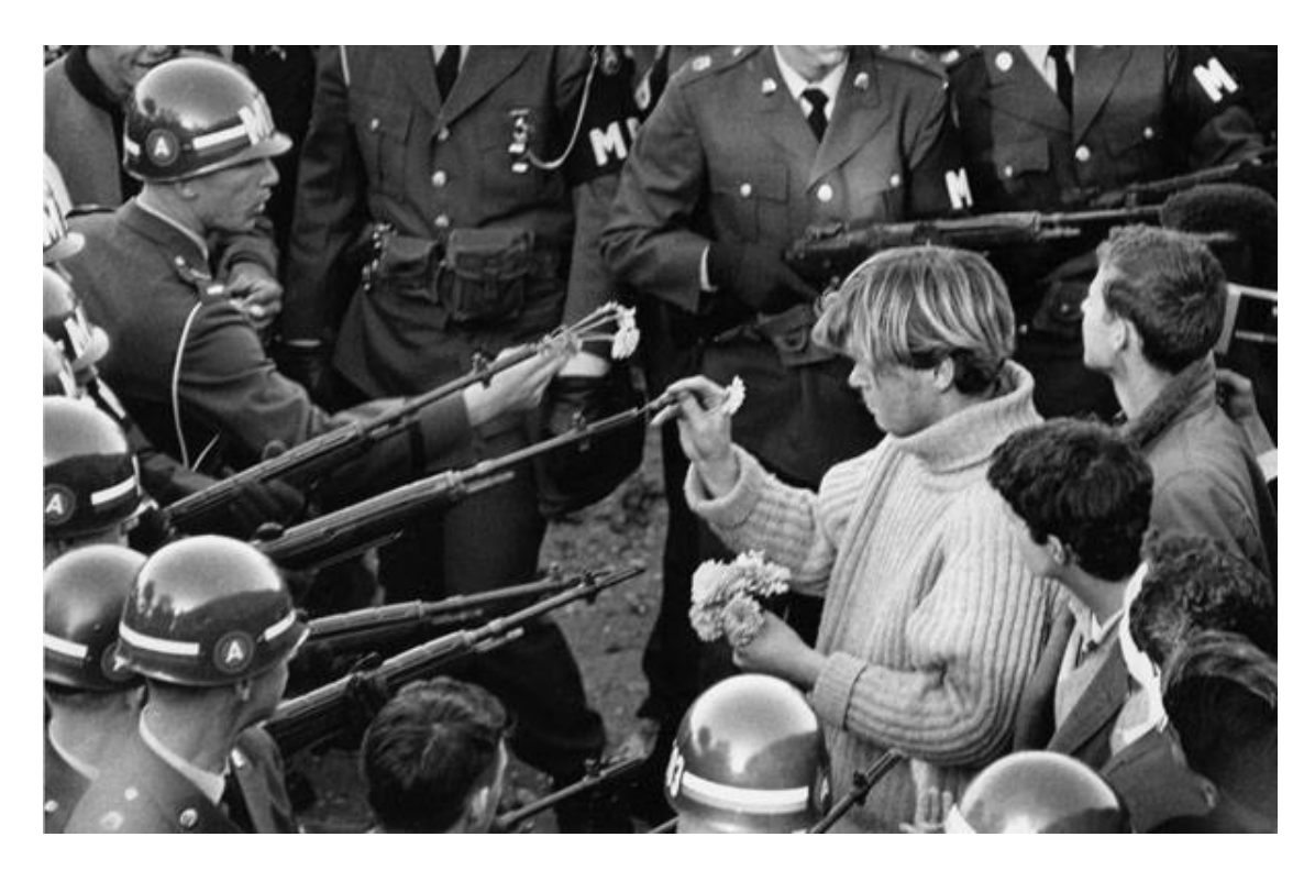
Figure 3 "Flower Power." Runner-up photograph for the Pulitzer Prize and "perhaps the most iconic photo of the turbulent 60s." A man places a flower in the barrel of a soldier's gun.<sup>27</sup>