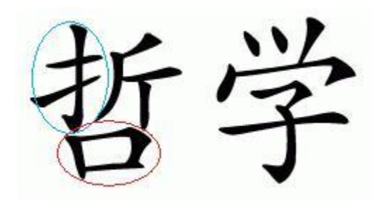
Figure 2 the character on the left means "philosophy": the portion encircled in blue means "hand", in red means "mouth." The character on the right means "the study of"

have a theory but not put it into practice is to not have a philosophy at all. The philosophical suggestions which are in this paper presuppose a seamless interface between thought and action—their ultimate end is pragmatic, and though founded upon ideals, there is a balanced emphasis on thought and action. In the end, a theory which doesn't get applied to one's life is essentially useless. And it is useful to the degree that it has the intended effect. For our purposes here, because I theorize about effective ways to better man and society, if the theory does not actually better man and society, it is also useless. Suggestions have been considered against this condition.