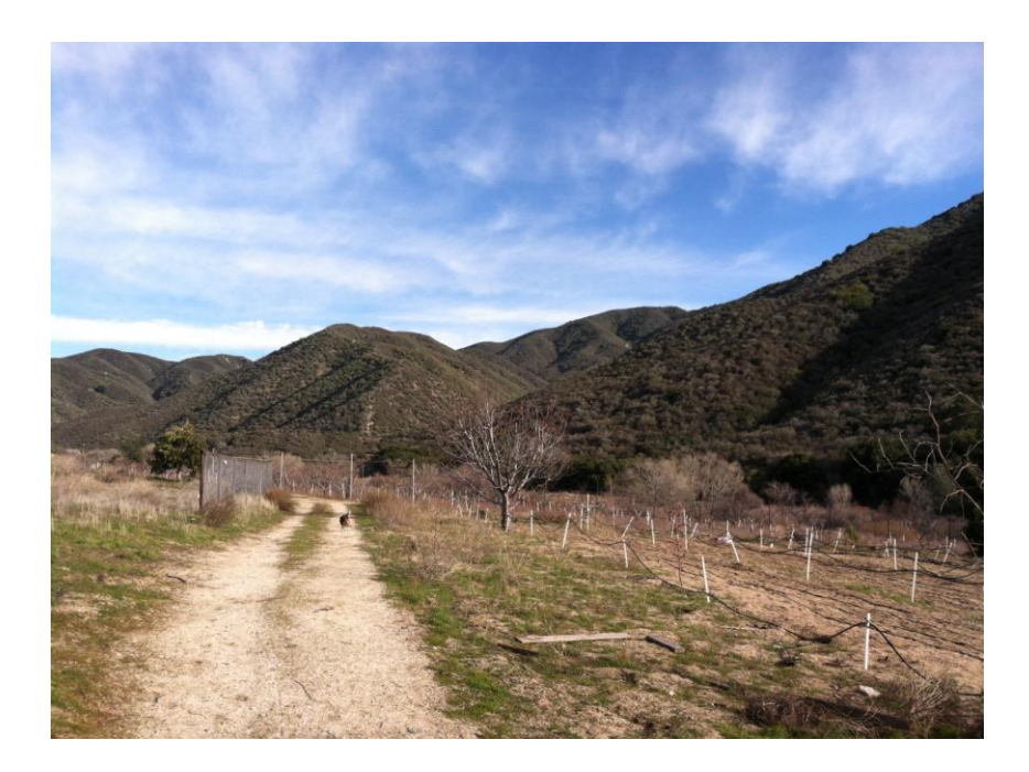
Figure 4 Ananda Marga Organic Peach Farm, Lake Hughes, California

natural. There was no television in the house, no reason to travel to a nearby town, no billboards, no shops, and no opportunities for alternative social stimulation.