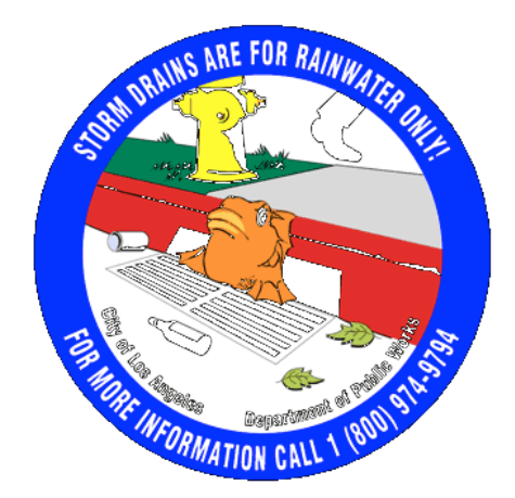
Figure 5. City of Los Angeles Stormdrain Medallion