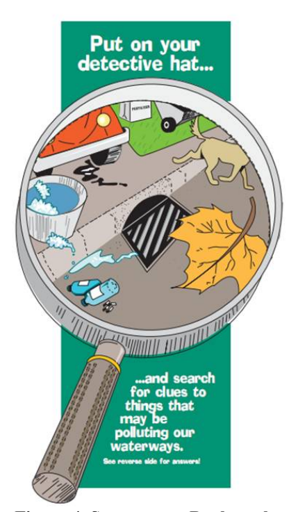
Figure 4. Stormwater Bookmark