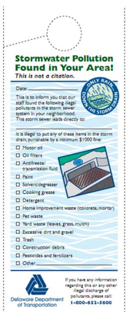
Figure 1. Illicit-discharge