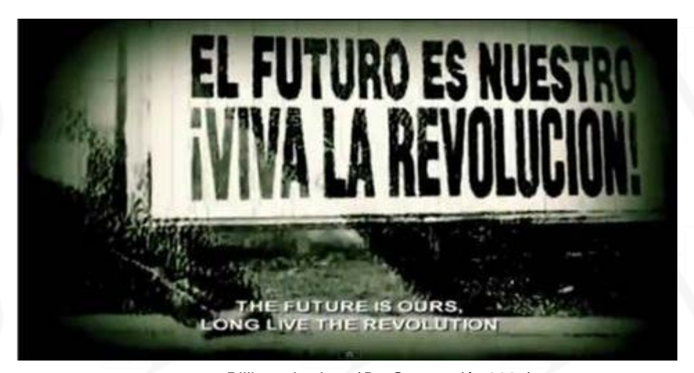
Billboards shot. (De Generación 2007)

As this speaker explains that his generation is not inspired to come together, and create something as previous generations had done, the camera pans to show the lingering past revolutionary narrative hovering over Havana celebrating a particular identity. The billboards covered with the official discourse are in stark contrast with the speaker's doubts. He finishes his thought while the camera displays the slogans of the Revolution, as a nostalgic instrumental lullaby plays in the background.