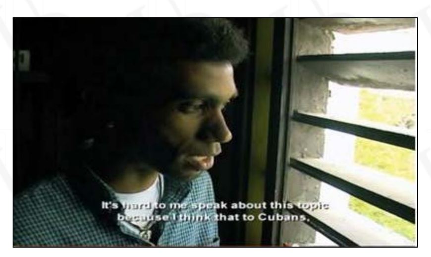
Talking about leaving and travel. (De Generación 2007)

These products serve as reminders of Cuba's place in a globalized economy. With imported products comes the ever-present Cuban topic of life beyond Cuba: travel, and emigration, while the inability to travel internationally remains a frustration for many of the speakers. As the camera focuses on the face of one Cuban man as he looks out through the slats of a window he explains, "Me cuesta un poco hablar de este tema...La cuestión de la inmigración nos ha dolido un poco y ver que el futuro de tu país solamente digamos que está en un marco donde lo único que puedas ver sea posibilidad de inmigrar...es bastante triste".