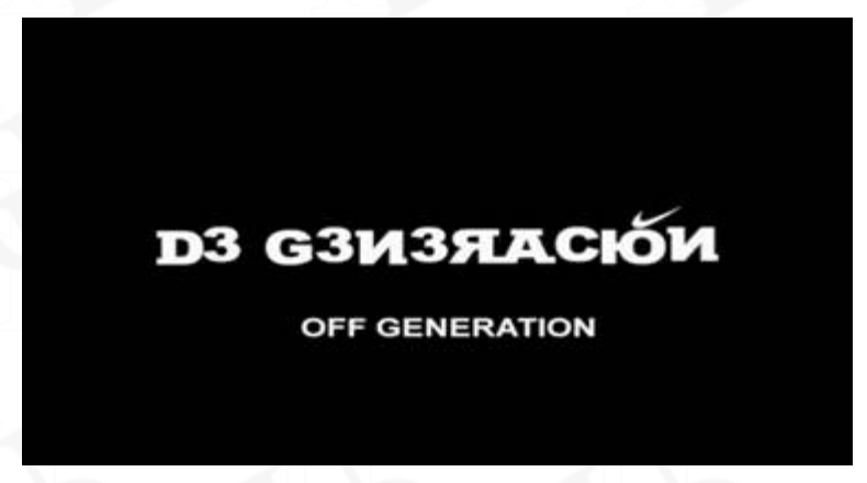
Title screen. (De Generación 2007)

The drawings culminate with the title De Generación appearing in white letters on a simple black background. At a closer look the letters of the film's title also embody Cuba's past and present. The letters 'n', 'e' and 'r' appear backwards, reminiscent of the Cyrillic alphabet, while the 'o' in the title is accented with Nike's trademark "Swoosh". The script reflects Cuba's complicated history where the Soviet influences share the screen with the presence of US capitalism, materialism, and imported goods.