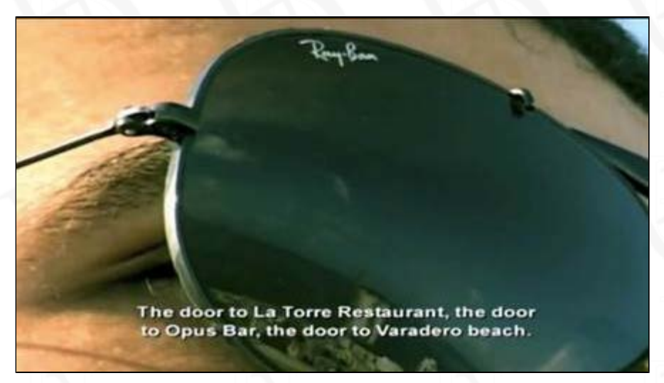
Ray Ban glasses. (De Generación 2007)

As the camera returns to the interviews with the individual Cubans, one young man shares that he is tired of Cuba's blinding sun and would like to see the cloudy days of France. He sits on the roof deck of a building overlooking Havana as he stares into the sun, with Ray Ban sunglasses and an Argentine soccer jersey. His eyewear and clothing are further proof of Cuba's connection with life beyond the island's limits.