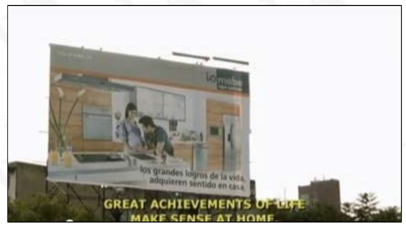
Billboard in Mexico. (Ex Generación 2009)

The camera focuses on the nuclear physicist as he states that while it was difficult to decide to leave Cuba, the professional possibilities on the island were slim. As he speaks, the camera shows a Mexican billboard advertising home supplies, with the words "Los grandes logros de la vida, adquieren sentido en casa". This message is in contrast with the words of the physicist as he explains that it did not make sense for him to stay home in Cuba. The modern billboard advertisement is also in contrast with the sepia revolutionary messages plastered on the billboards in De Generación , yet both these billboards in Mexico and those of De Generación reflect the competing external messages that surround the individuals distant from their daily realities.