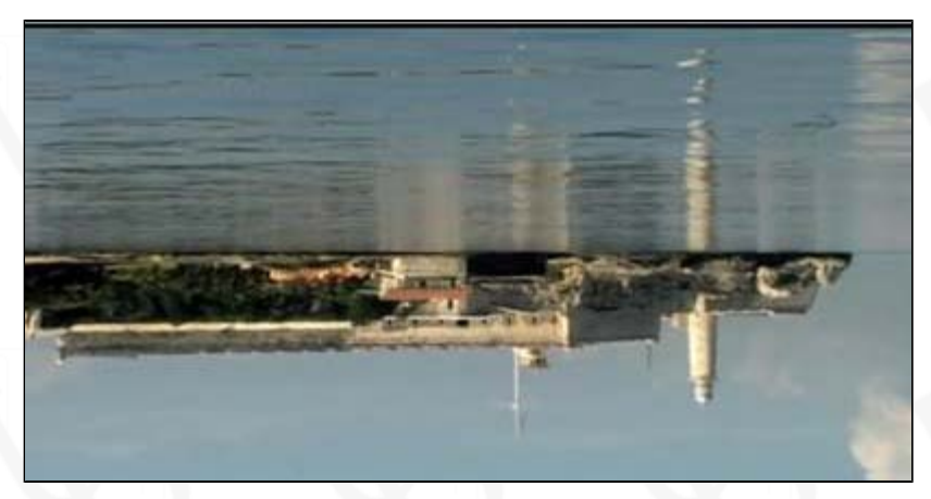
Upside down image of Havana. (De Generación 2007)

The inverted images with the noise of the boots underline that this individualistic reality is in deep contrast with the original ideals of the Revolution. The Revolution may have produced the opposite outcome of its objective.