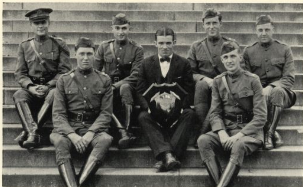
PLATTSBURG RIFLE TEAM