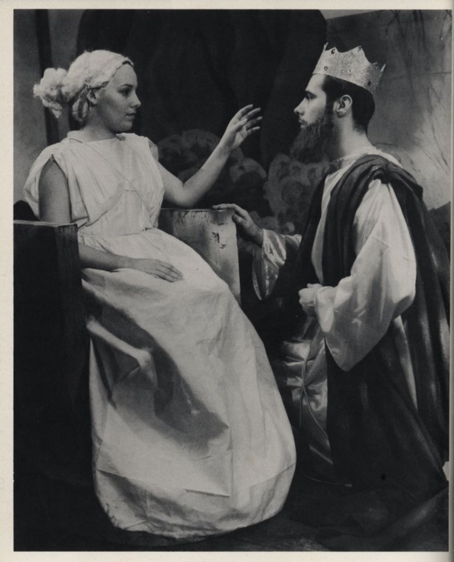
CHILDREN'S THEATRE KING MIDAS March 9th and 10th