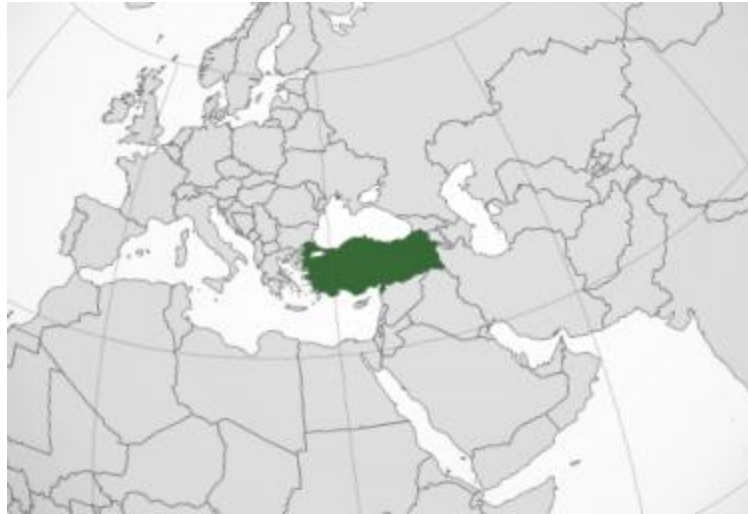
Figure 2.1. Geographic position of Turkey ( Wikipedia.org )

How Turkey perceives citizenship and citizenship education is heavily influenced by both its geographical and (especially) its geopolitical location. Having lands within both Europe and Asia, being surrounded by three seas (Black Sea, Aegean Sea, Mediterranean), and being regarded as a 'bridge' between the West and the East, Turkey has always considered itself as one of the most strategically important lands in the world throughout history.