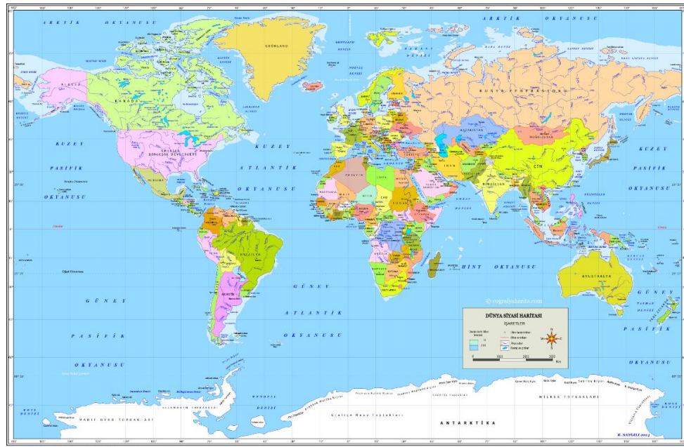
Figure 3.3: Turkish Version World Map ( cografyaharita.com )