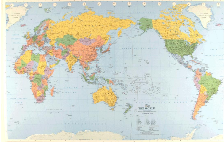
Figure 3.2: Chinese Version World Map