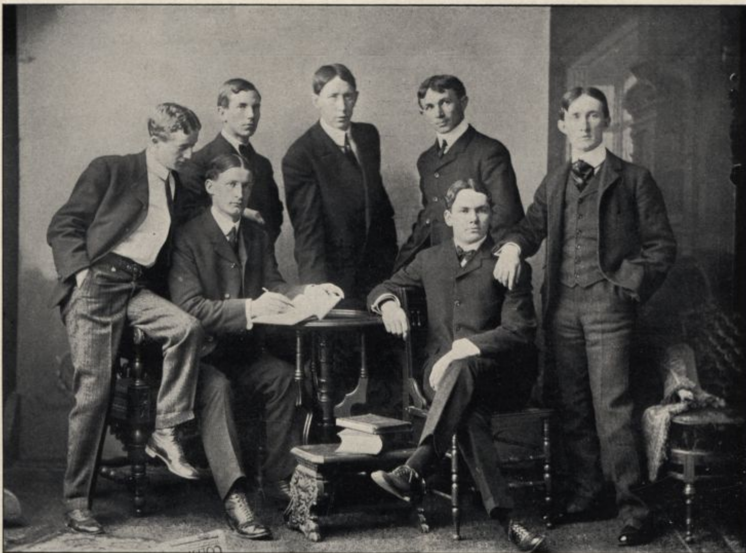
EDITORS AND BUSINESS MANAGERS OF "THE DERELICT."