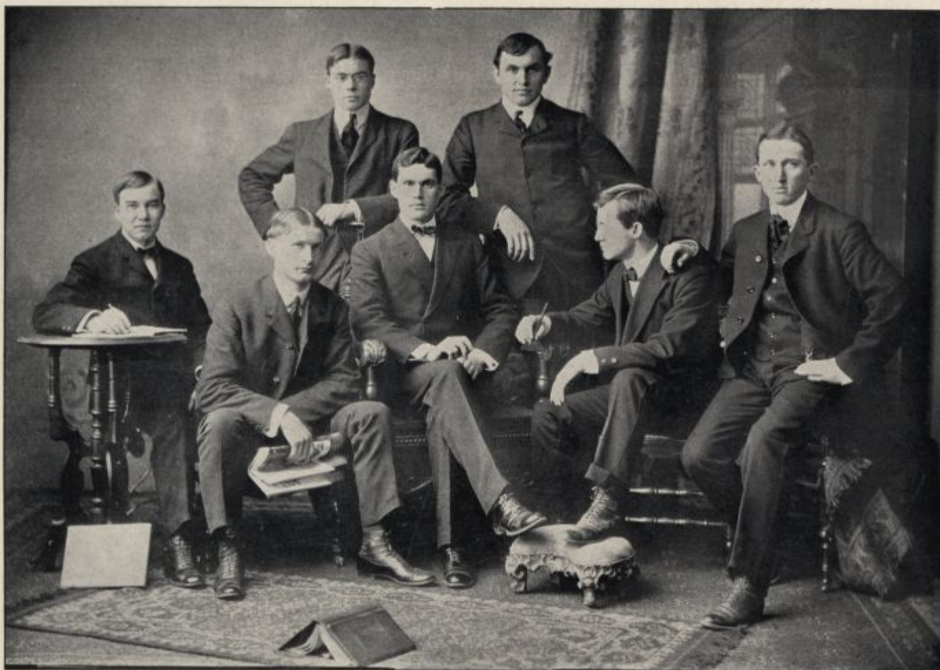
EDITORIAL BOARD OF "THE REVIEW."