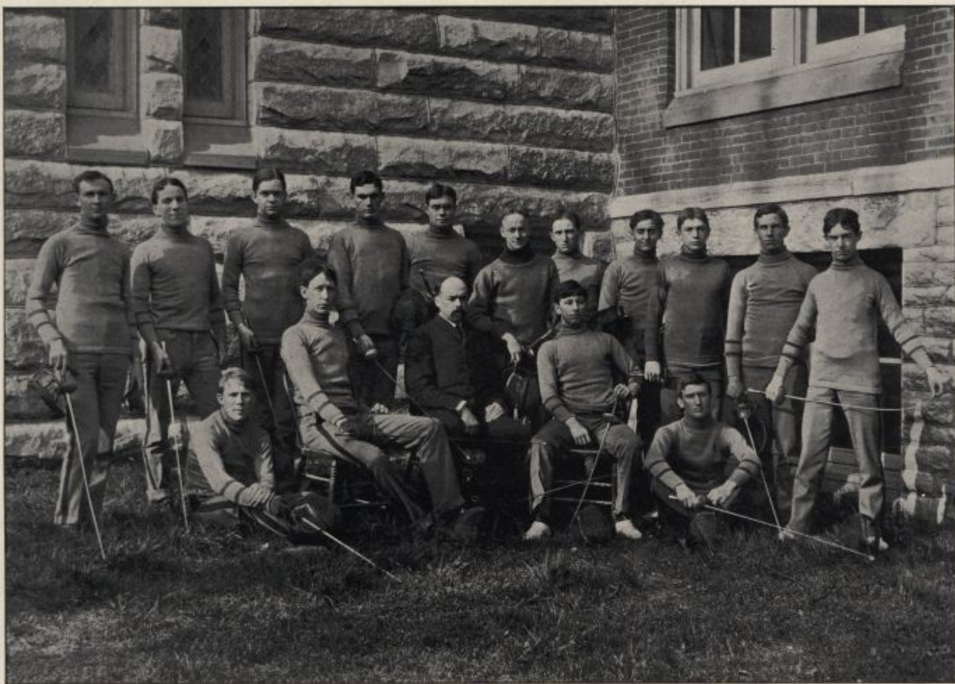
THE FENCING TEAM.