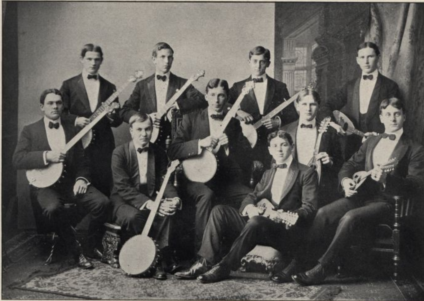
THE BANJO AND MANDOLIN CLUB.