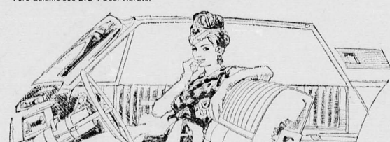
Spacious interior of new ultra-luxurious Ford LTD