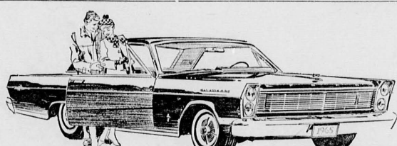
Total Performance 1965 Ford Galaxie 500 LTD 4-Door Hardtop

SATURDAY CONTINUOUS FROM 2 P.M. SUNDAY CONTINUOUS FROM 4 P.M.