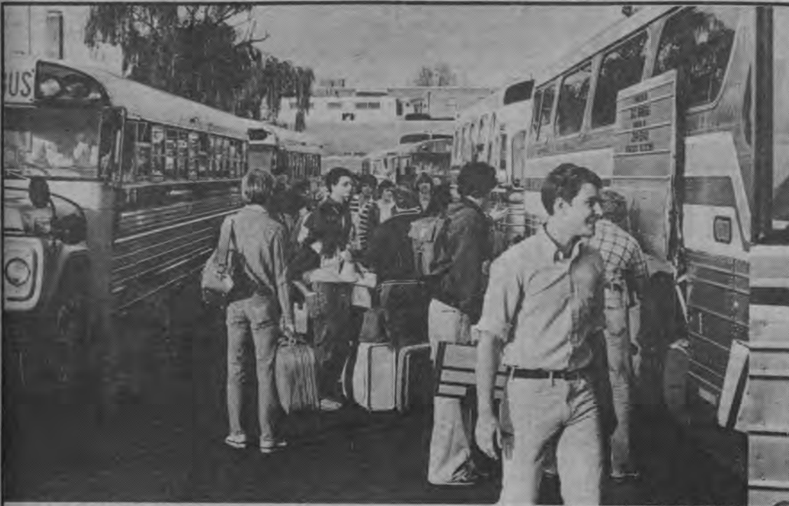
HEADING HOME for the holidays, hundreds of university students took advantage of bus trips offered by the Resident Student Association. Over 450 students participated in the most successful bus trip ever sponsored by the group...