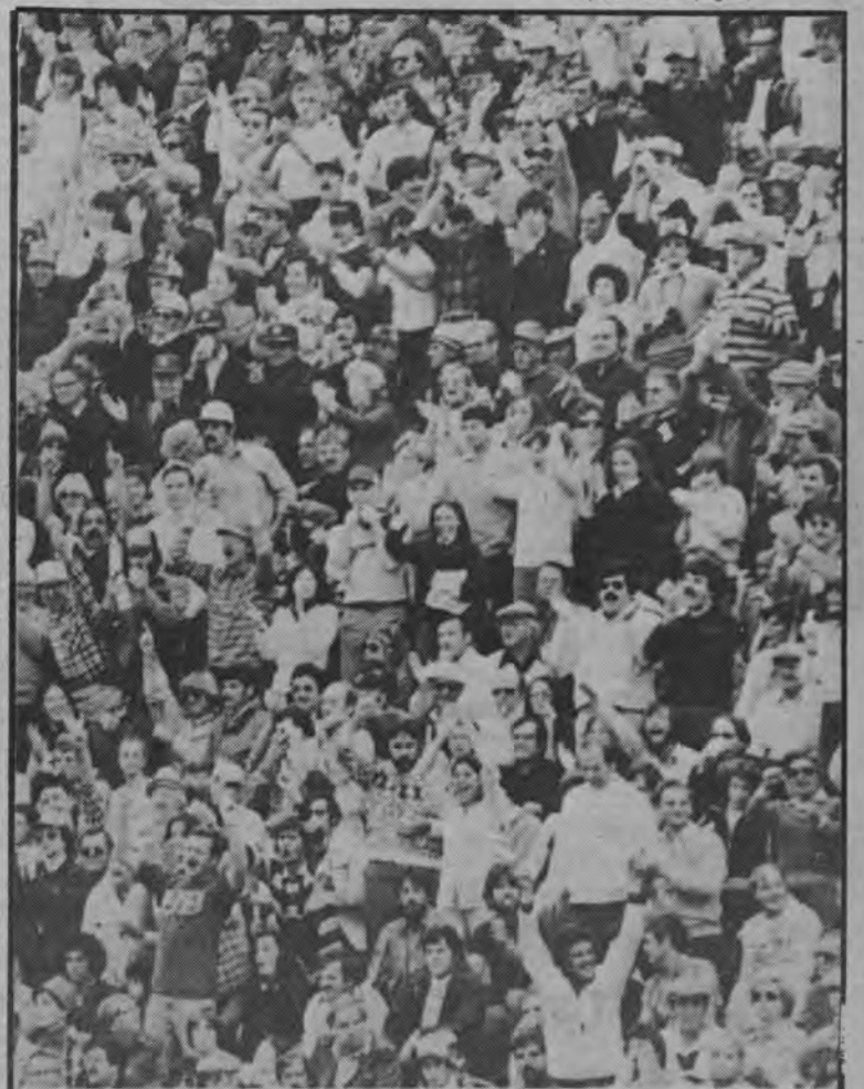
...MEANWHILE 14,000 people — a stadium playoff record — attended the quarter-final match against Virginia Union.

"Meetings are a bureaucratic mechanism. All these committees are full of you-know-what," stated an alumnus who was partly