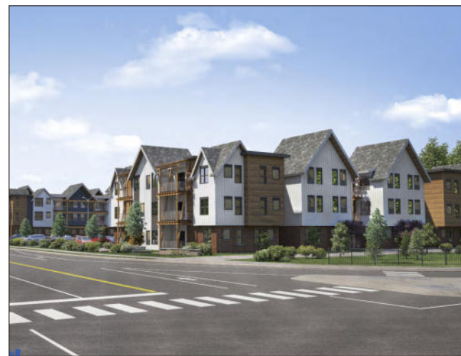
An artist's rendering shows the apartments and townhouses planned for the Dickinson dorm site. The city of Newark is seeking opinions on a series of broad recommendations aimed at changing how the city approaches rental housing.

Affordable housing initiatives: The city should