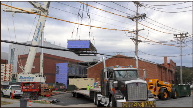
Workers use a crane to build an addition to the University of Delaware's Life Sciences Research Facility.