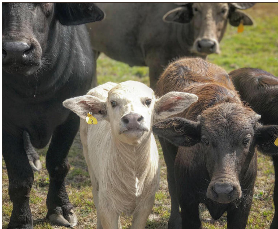
Casper is the lone white calf of the three Asian water buffalo youngsters at Hill Billy Farms.