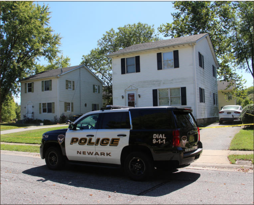
A Newark man has pleaded guilty but mentally ill to killing his girlfriend inside this home on Westfield Drive, police said.