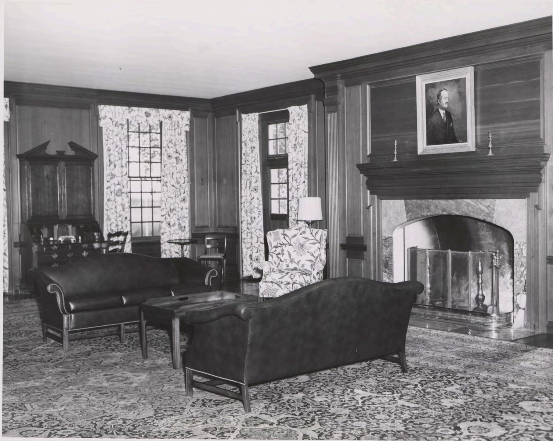
Large Library of Buena Vista