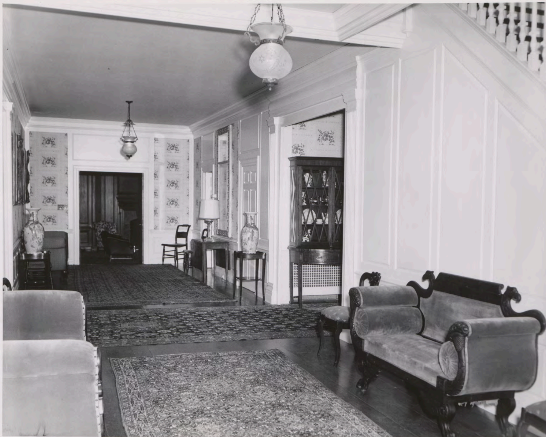
South Hall of Buena Vista