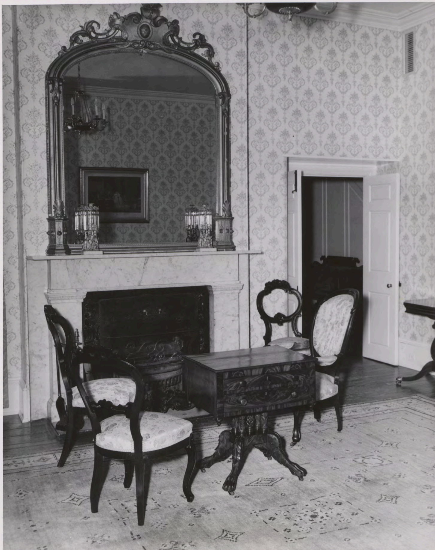
Parlor of Buena Vista, home of John M. Clayton