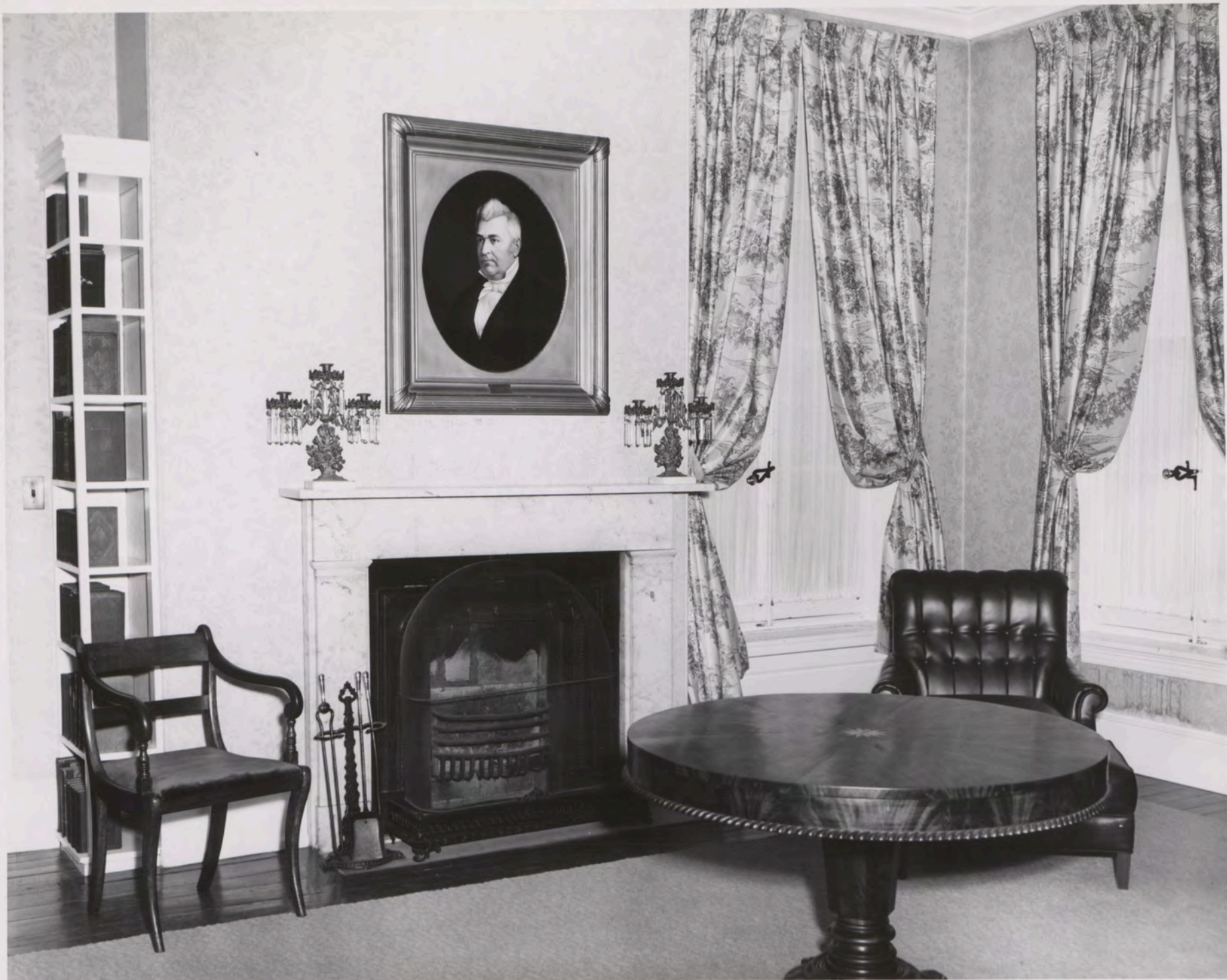
John M. Clayton Library of Buena Vista, home of John M. Clayton