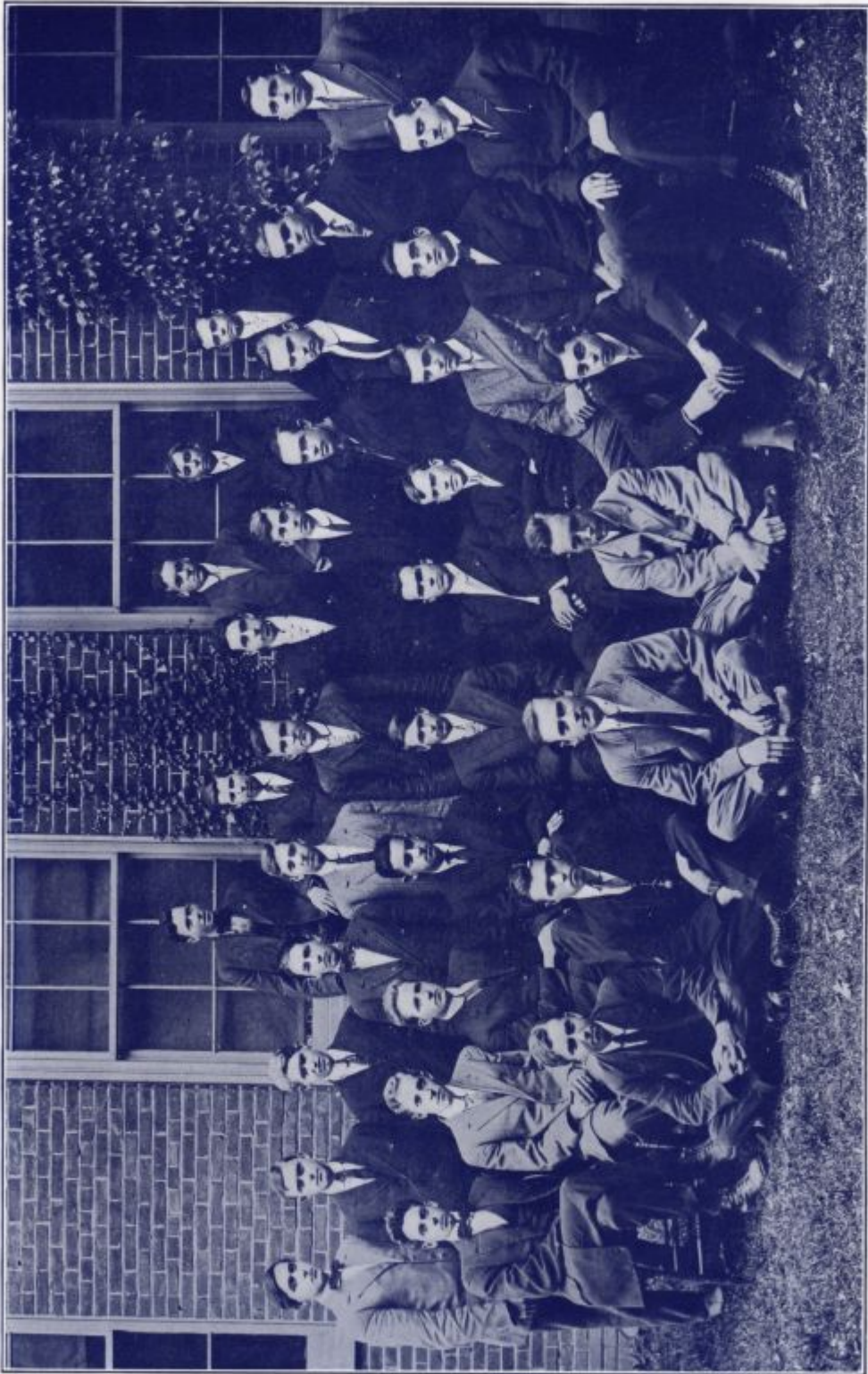
CLASS OF 1913