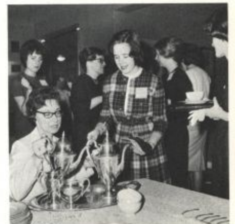
Mortar Board Tea