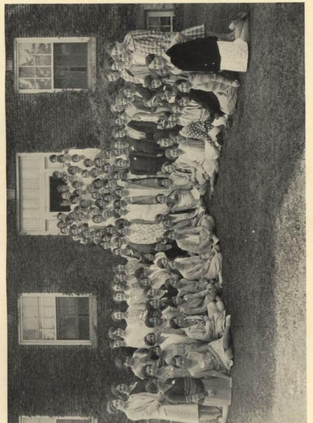
FRESHMAN CLASS PICTURE