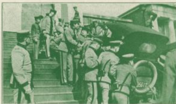
Such things as Freshmen do