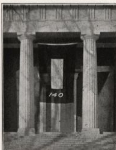
Our Service Flag