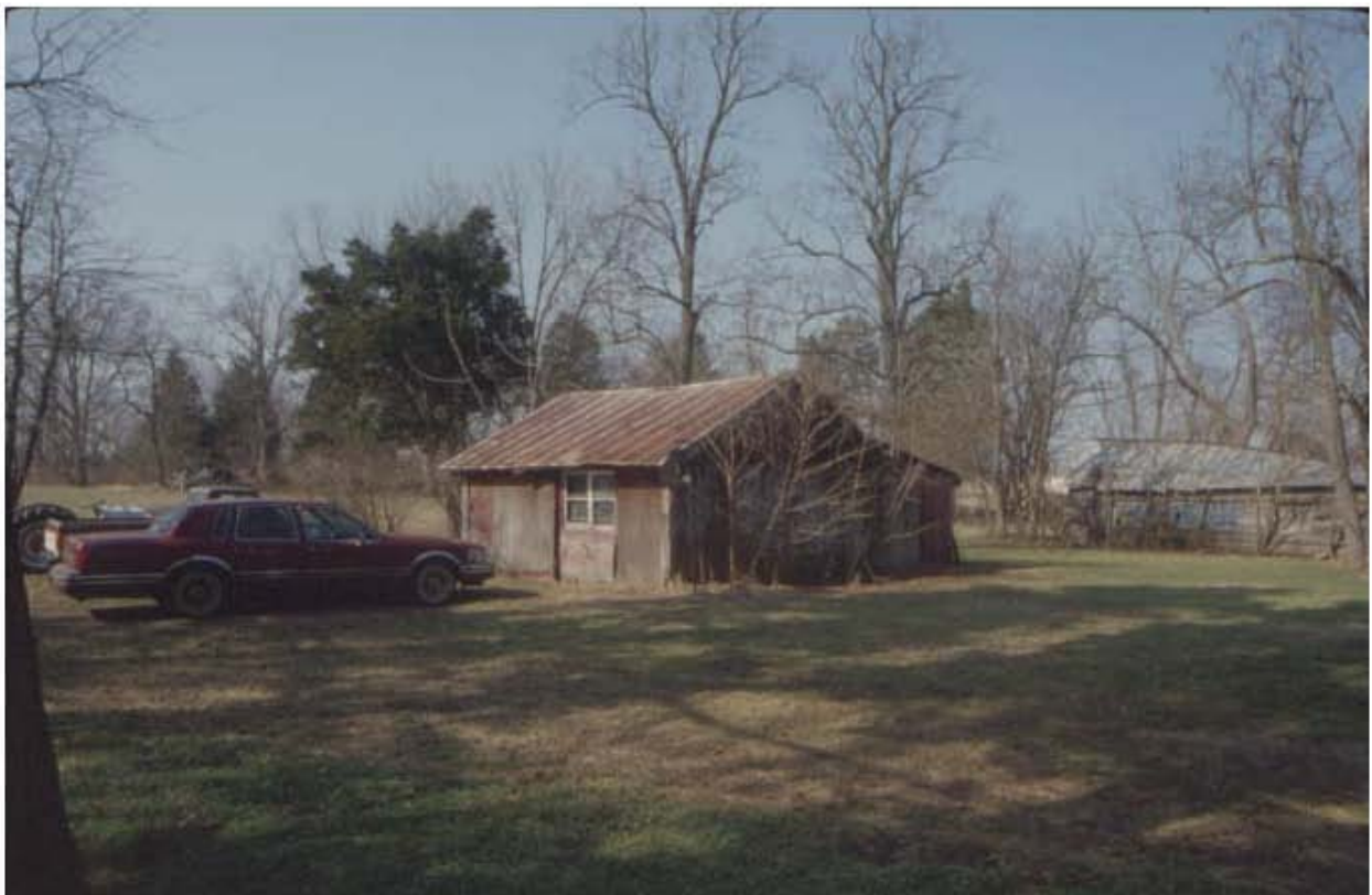
Figure 5: Jehu M. Reed Farm, view of east and south elevations of garage, looking northwest.