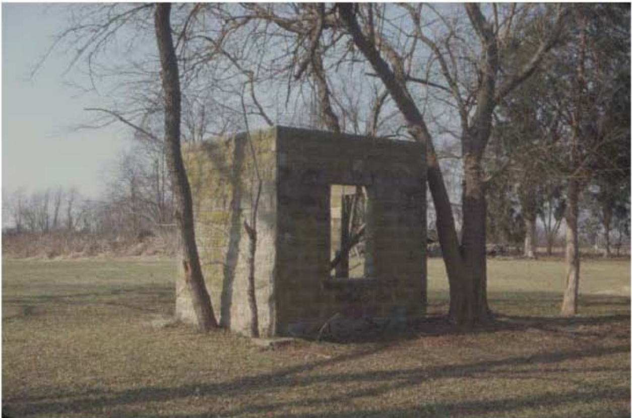
Figure 6: Jehu M. Reed Farm, view of north and east elevations of concrete block outbuilding, looking southwest.