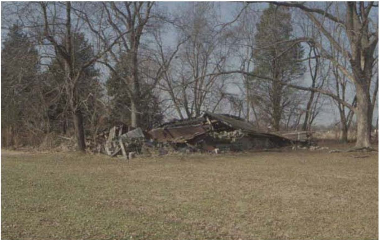
Figure 7: Jehu M. Reed Farm, view of collapsed shed at northwest corner of property.