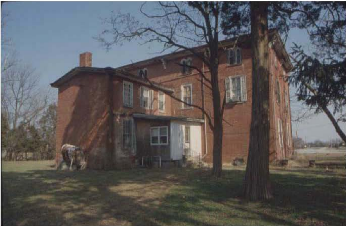
Figure 3: Jehu M. Reed House, view of west elevation looking northeast.