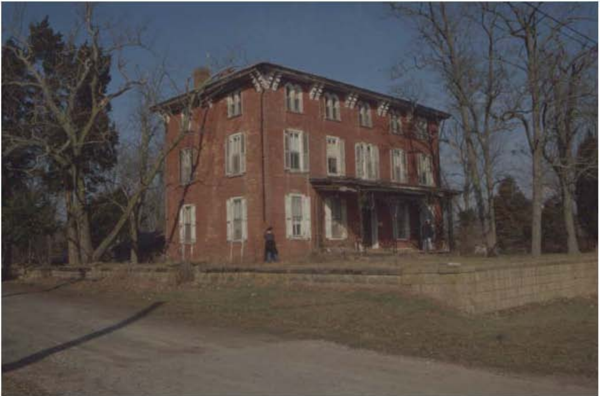
Figure 2: Jehu M. Reed House, view of south and east elevations looking northwest.