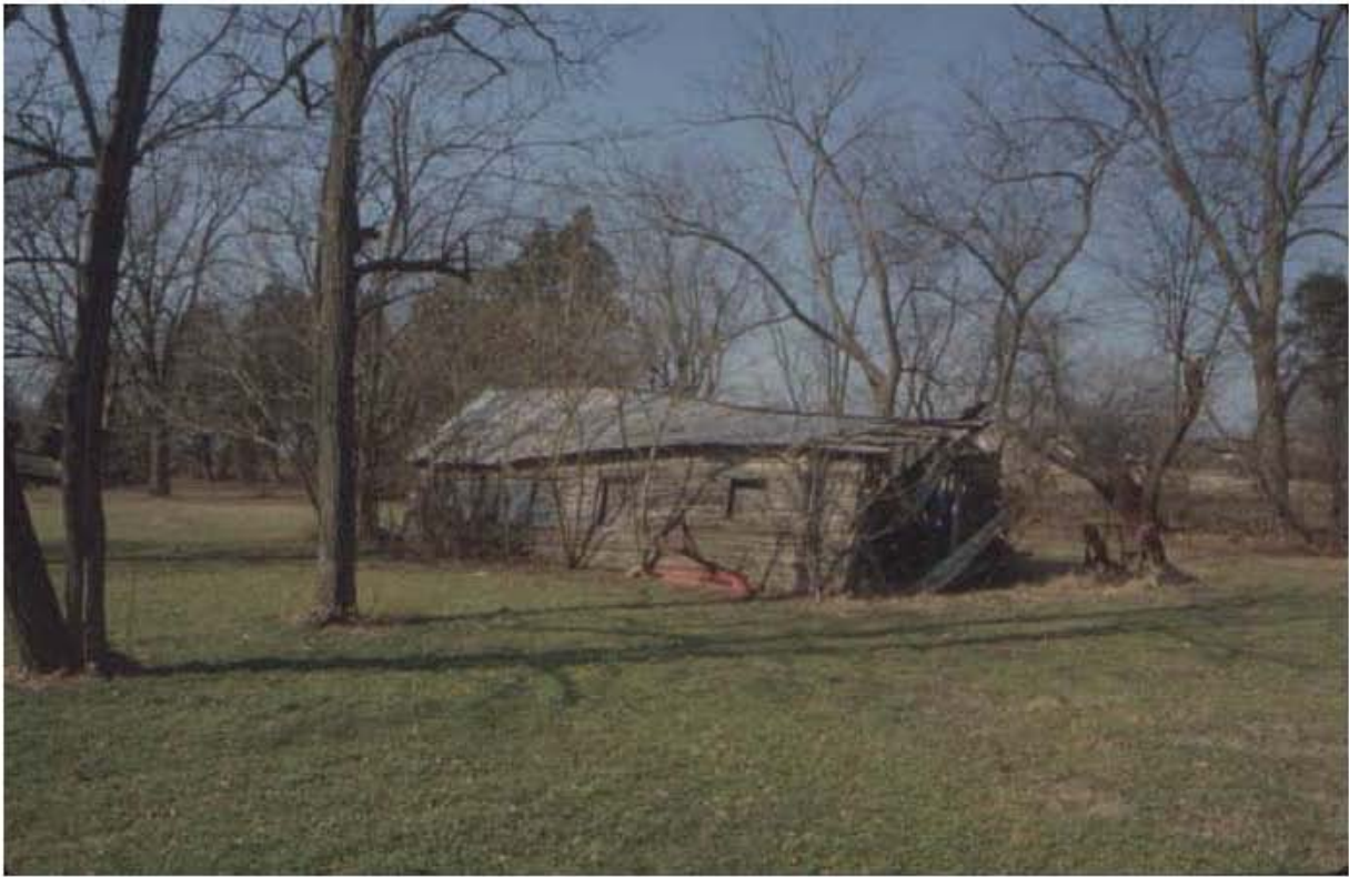
Figure 8: Jehu M. Reed Farm, view of north and east elevations of barn, looking southwest.