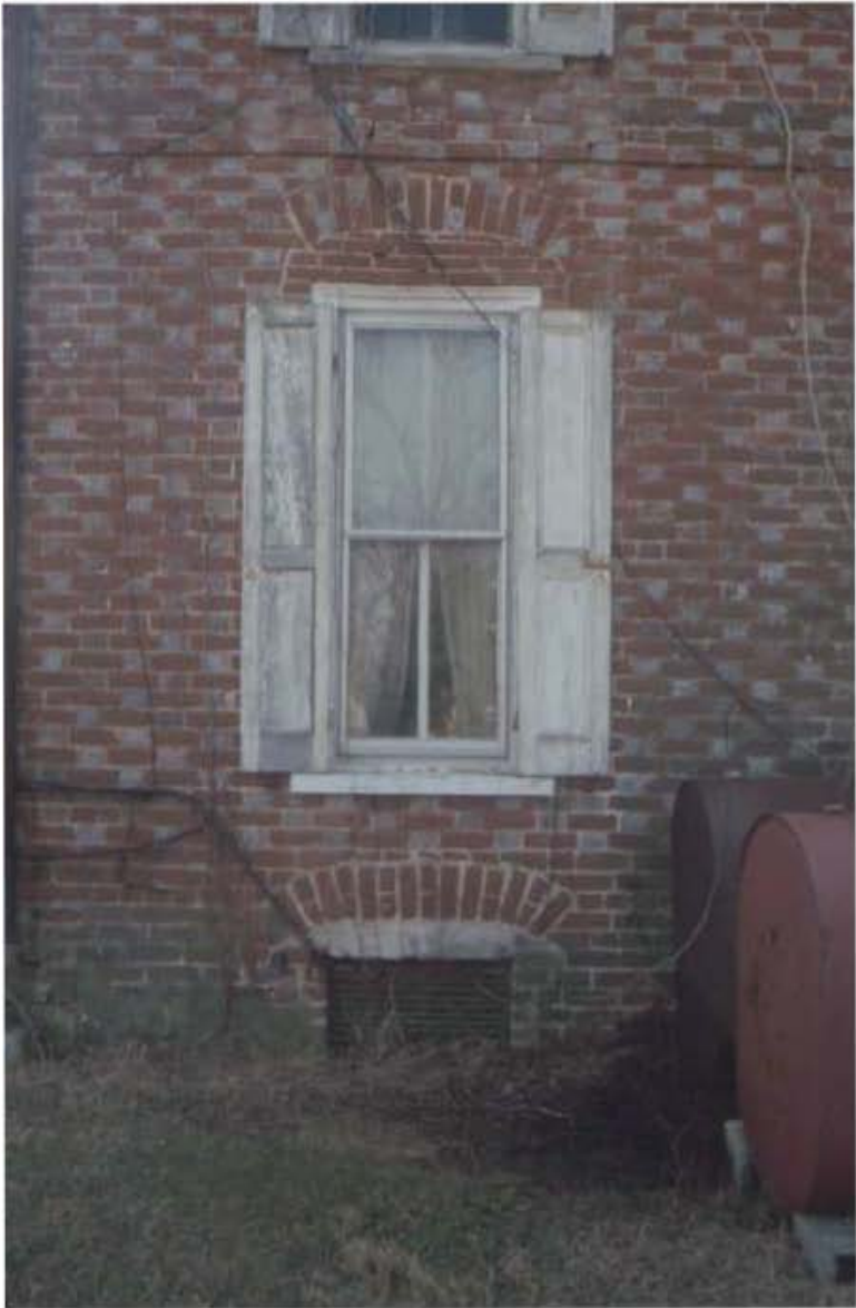
Figure 4: Jehu M. Reed House, detail of window on east elevation of Period I block.