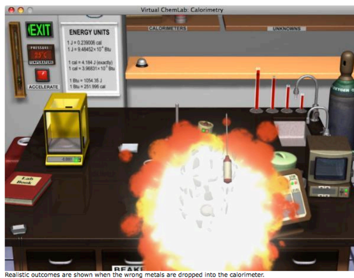
Realistic outcomes are shown when the wrong metals are dropped into the calorimeter.