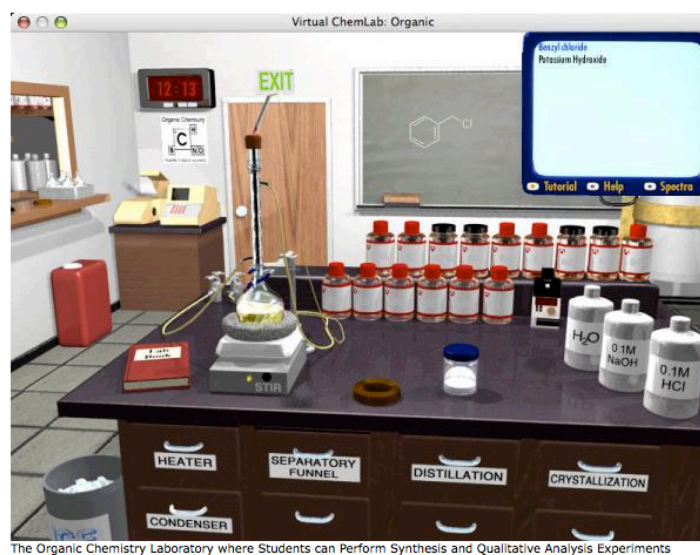
The Organic Chemistry Laboratory where Students can Perform Synthesis and Qualitative Analysis Experiments